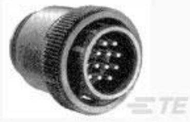
TE Part #206429-1 CPC PLUG ASSY, 11-4, REV SEX