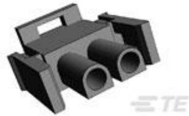
TE Part #1-480698-0 02P UMNL PLUG HSG NATL