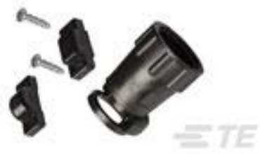
TE Part #206966-7 CABLE SHELL CLAMP SIZE 13