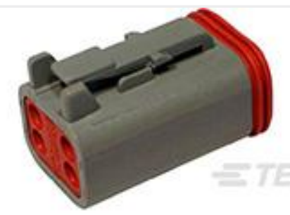
TE Part #DT06-4S PLG, 4P, GRY, N