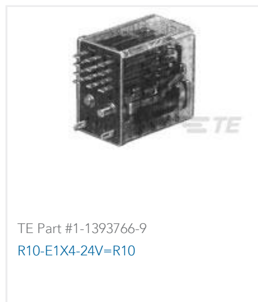
TE Part #1-1393766-9 R10-E1X4-24V=R10