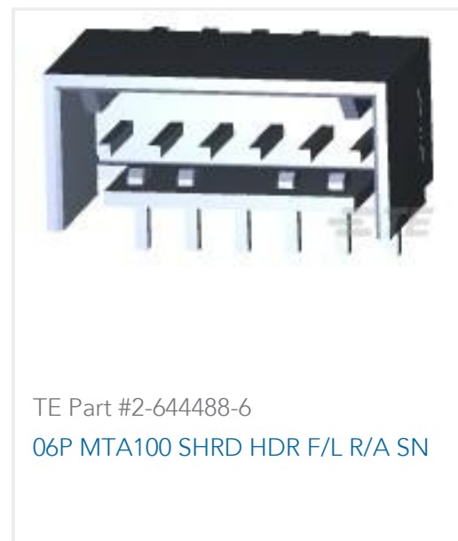
TE Part #2-644488-6 06P MTA100 SHRD HDR F/L R/A SN