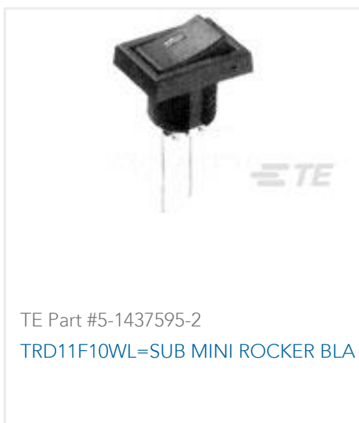
TE Part #5-1437595-2 TRD11F10WL=SUB MINI ROCKER BLA