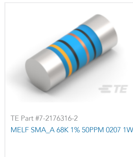
TE Part #7-2176316-2 MELF SMA_A 68K 1% 50PPM 0207 1W