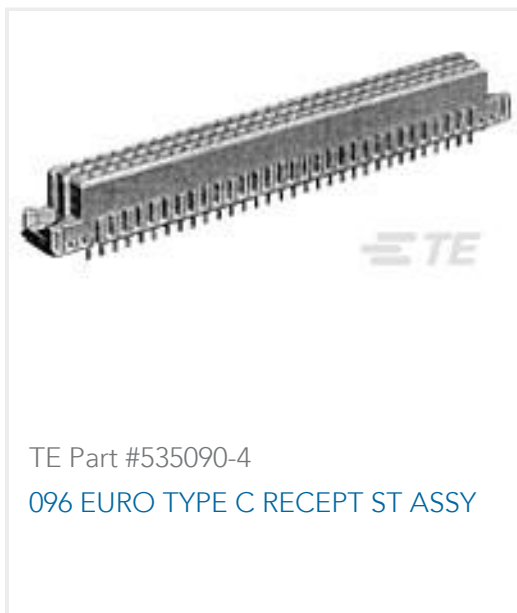
TE Part #535090-4 096 EURO TYPE C RECEPT ST ASSY