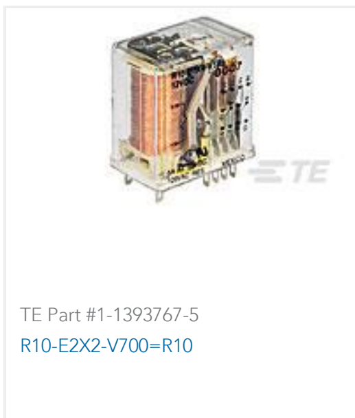
TE Part #1-1393767-5 R10-E2X2-V700=R10