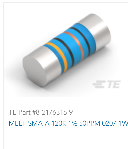
TE Part #8-2176316-9 MELF SMA-A 120K 1% 50PPM 0207 1W