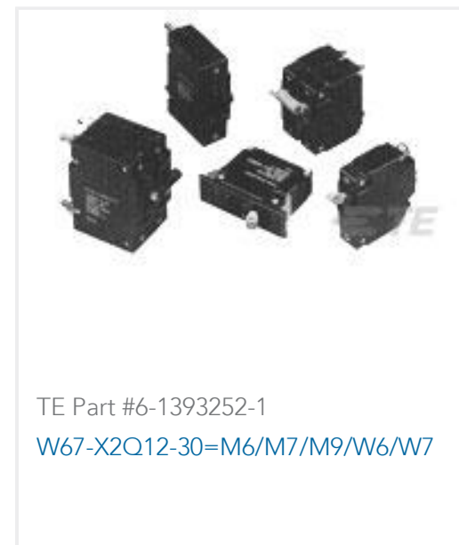
TE Part #6-1393252-1 W67-X2Q12-30=M6/M7/M9/W6/W7