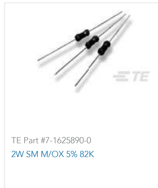
TE Part #7-1625890-0 2W SM M/OX 5% 82K