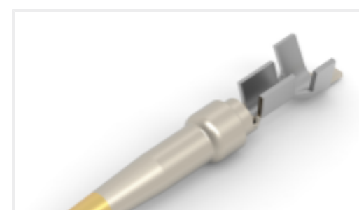
TE Part #CAT-035-DCCSC20 D-Sub Conn Contacts: Socket, Phosphor Bronze, Signal, Size 20