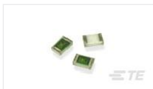
TE Part #1676250-1 RN 0805 20K 0.1% 10PPM CUT LENGTH