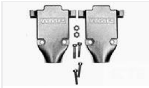
TE Part #5745173-3 CABLE CLAMP KIT,SZ 3