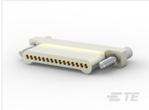
TE Part #CAT-SSL-PLUG NANONICS DUALOBE Connector: Plug, Plastic Shell