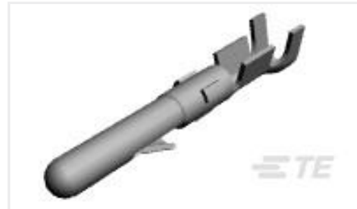
TE Part #60620-1 CMNL PIN 20-14 TPBR L/P