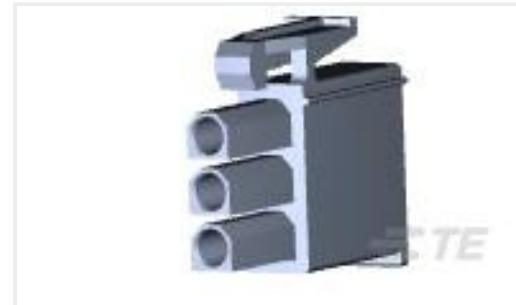
TE Part #172166-1 3 CIR UNIV M-N-L PLUG