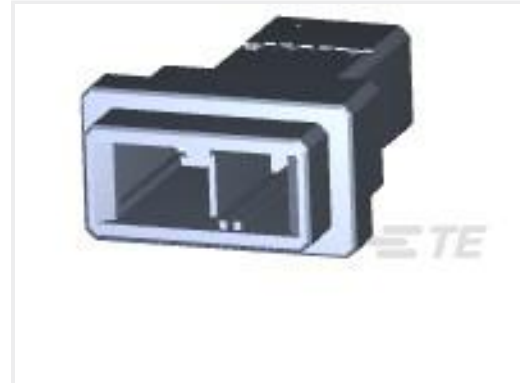
TE Part #1-179552-2 DYNAMIC D-3200S TAB HSG 2P K/X