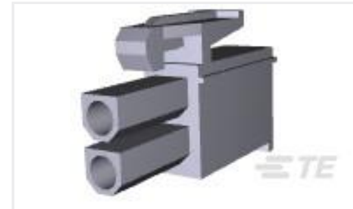
TE Part #172165-1 2 CIR UNIV M-N-L PLUG NATL