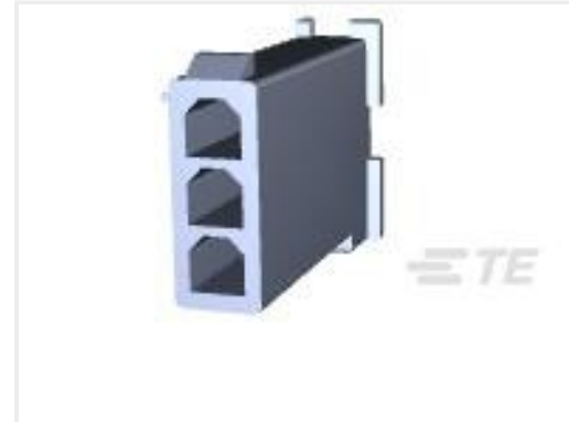
TE Part #172234-1 3P MINI UNIVERSAL MATE-N-LOK CAP HOUSING