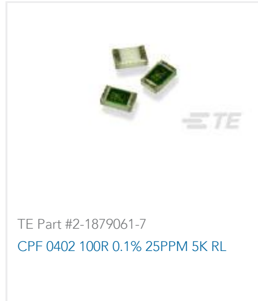
TE Part #2-1879061-7 CPF 0402 100R 0.1% 25PPM 5K RL