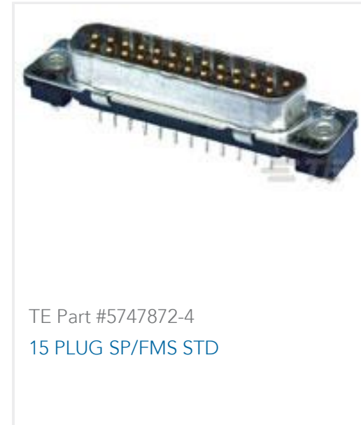
TE Part #5747872-4 15 PLUG SP/FMS STD