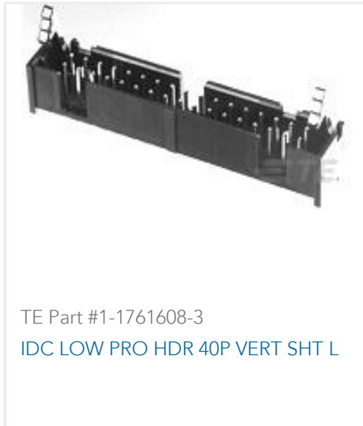
TE Part #1-1761608-3 IDC LOW PRO HDR 40P VERT SHT L