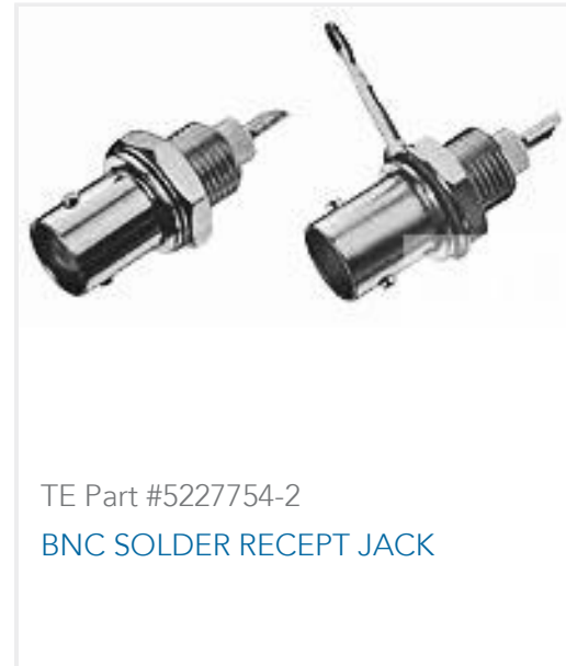
TE Part #5227754-2 BNC SOLDER RECEPT JACK