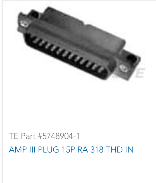
TE Part #5748904-1 AMP III PLUG 15P RA 318 THD IN