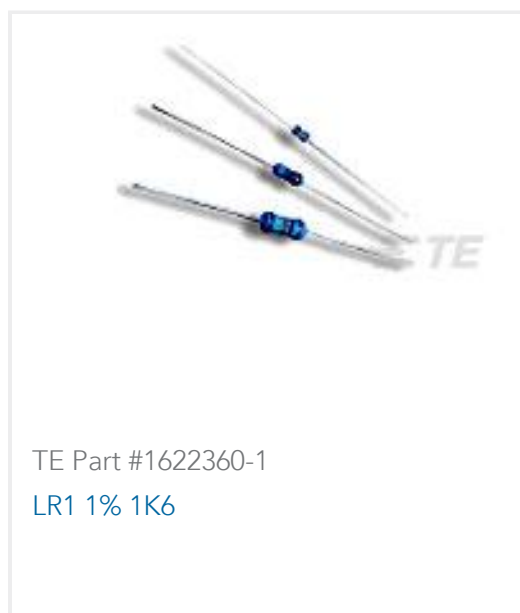
TE Part #1622360-1 LR1 1% 1K6