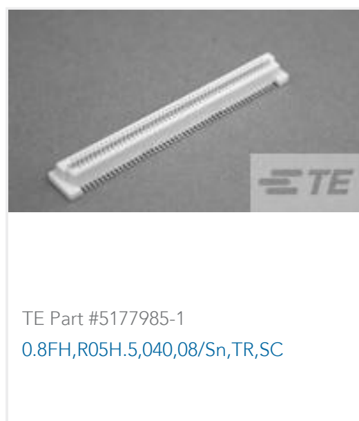
TE Part #5177985-1 0.8FH,R05H.5,040,08/Sn,TR,SC