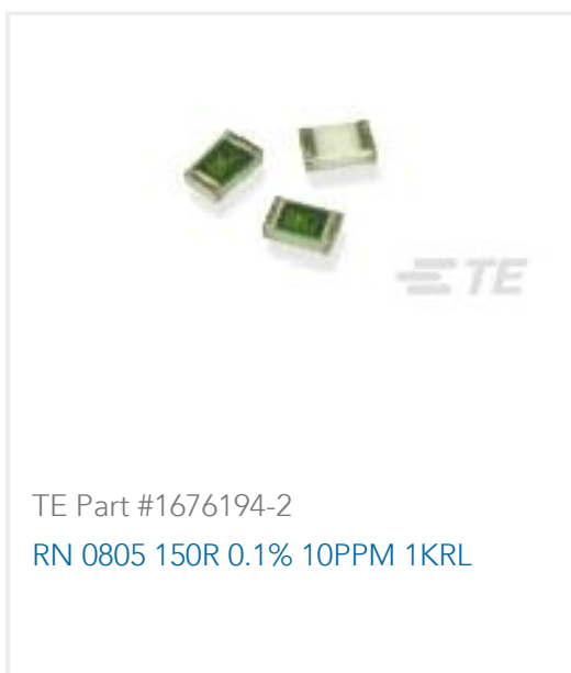
TE Part #1676194-2 RN 0805 150R 0.1% 10PPM 1KRL