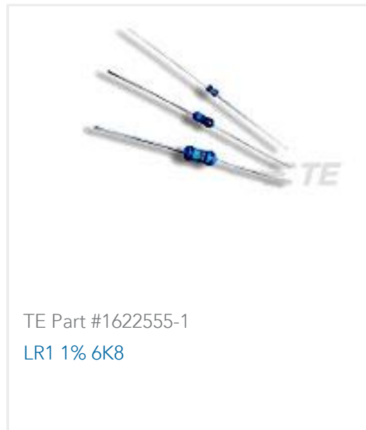
TE Part #1622555-1 LR1 1% 6K8