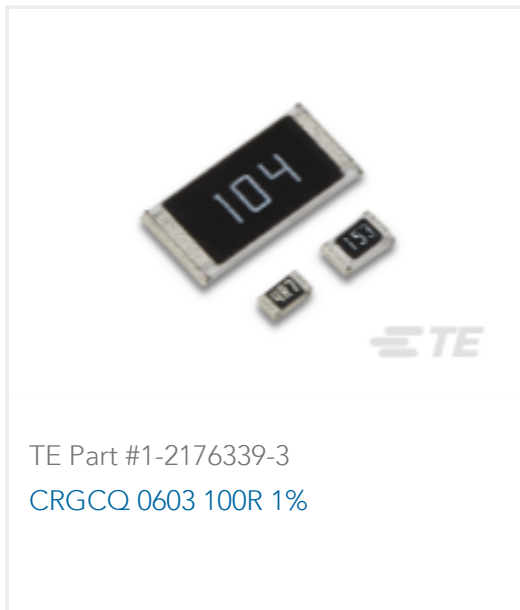
TE Part #1-2176339-3 CRGCO 0603 100R 1%