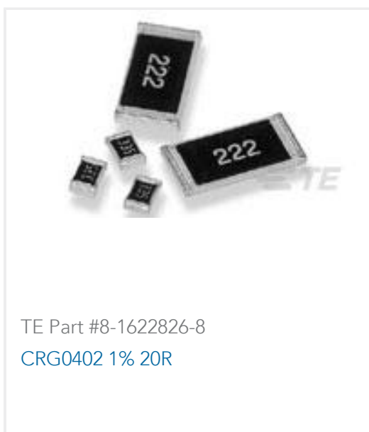
TE Part #8-1622826-8 CRG0402 1% 20R