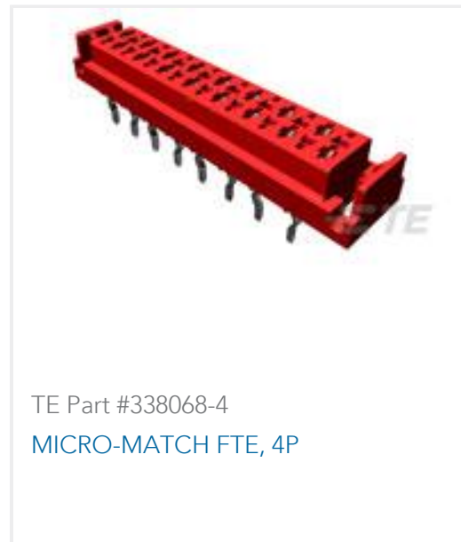
TE Part #338068-4 MICRO-MATCH FTE, 4P