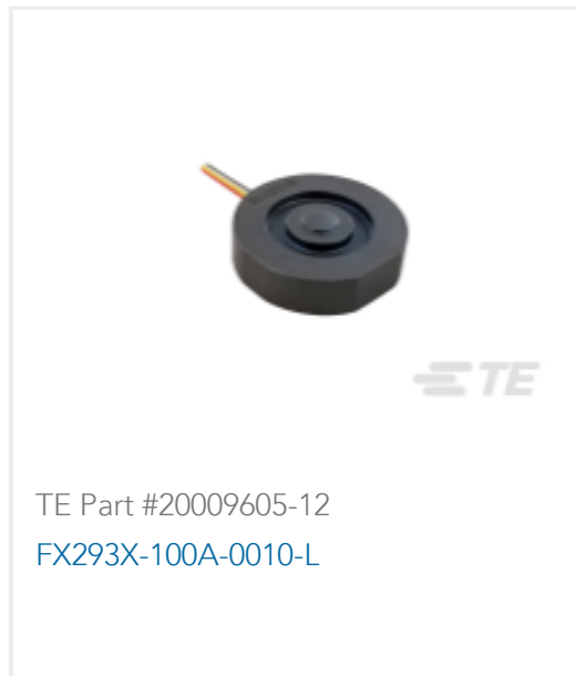
TE Part #20009605-12 FX293X-100A-0010-L