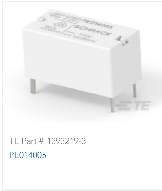
TE Part # 1393219-3 PE014005