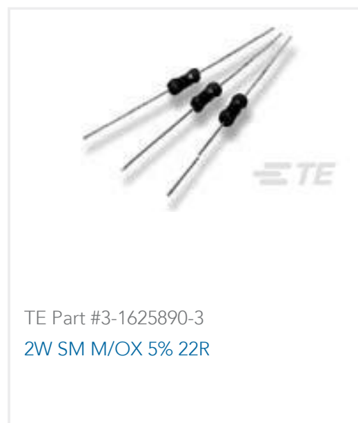
TE Part #3-1625890-3 2W SM M/OX 5% 22R