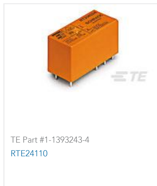
TE Part #1-1393243-4 RTE24110