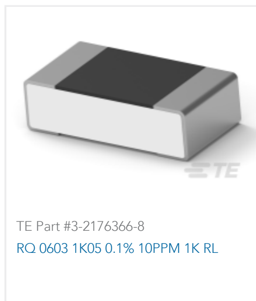
TE Part #3-2176366-8 RQ 0603 1K05 0.1% 10PPM 1K RL