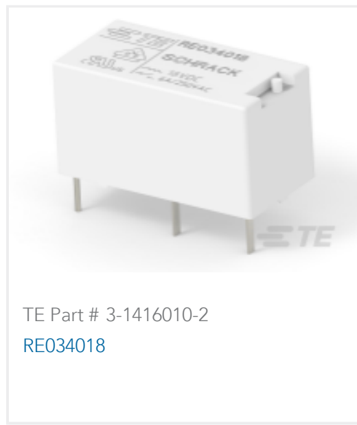
TE Part # 3-1416010-2 RE034018