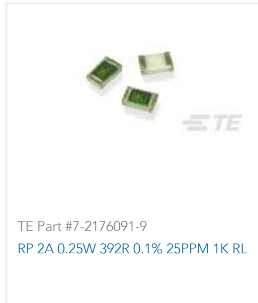
TE Part #7-2176091-9 RP 2A 0.25W 392R 0.1% 25PPM 1K RL