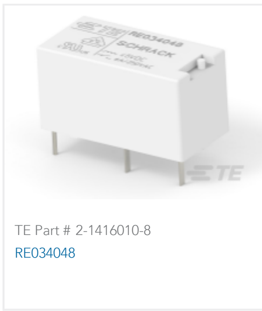
TE Part # 2-1416010-8 RE034048