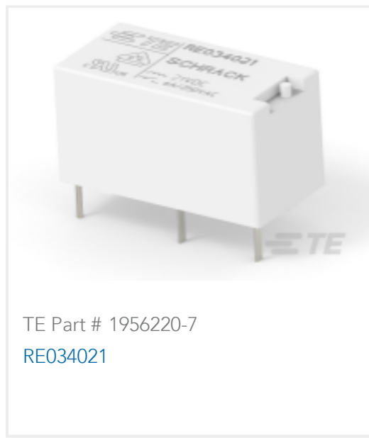
TE Part # 1956220-7 RE034021