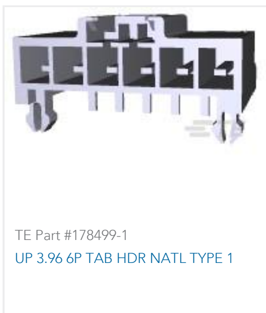
TE Part #178499-1 UP 3.96 6P TAB HDR NATL TYPE 1