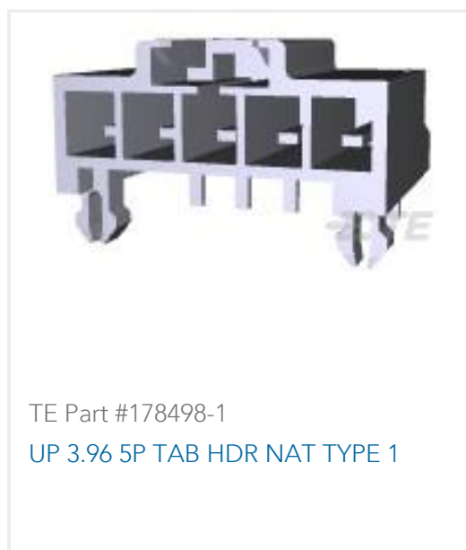
TE Part #178498-1 UP 3.96 5P TAB HDR NATL TYPE 1