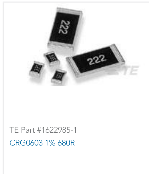
TE Part #1622985-1 CRG0603 1% 680R