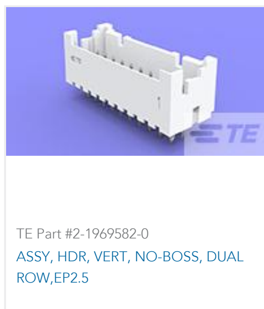
TE Part #2-1969582-0 ASSY, HDR, VERT, NO-BOSS, DUAL ROW,EP2.5