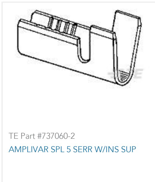
TE Part #737060-2 AMPLIVAR SPL 5 SERR W/INS SUP