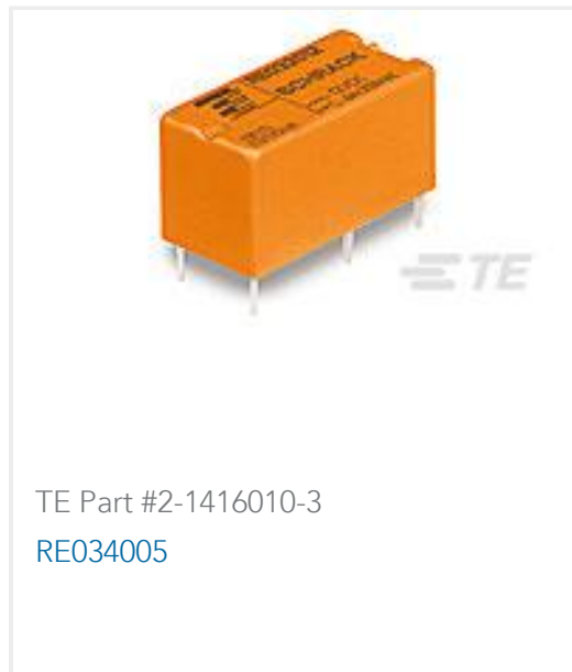
TE Part #2-1416010-3 RE034005