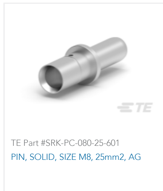
TE Part #SRK-PC-080-25-601 PIN, SOLID, SIZE M8, 25mm2, AG