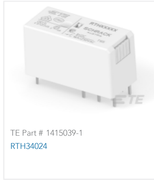
TE Part # 1415039-1 RTH34024