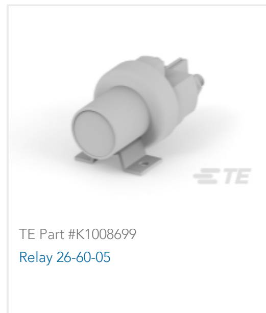
TE Part #K1008699 Relay 26-60-05