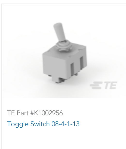
TE Part #K1002956 Toggle Switch 08-4-1-13