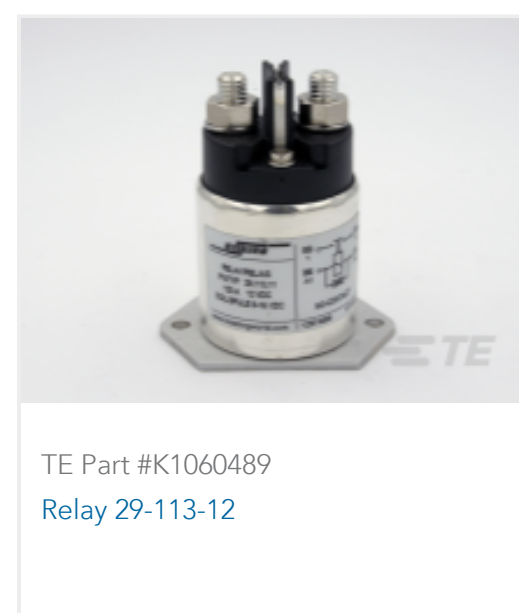
TE Part #K1060489 Relay 29-113-12