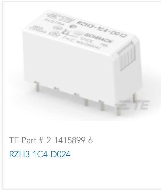
TE Part # 2-1415899-6 RZH3-1C4-D024