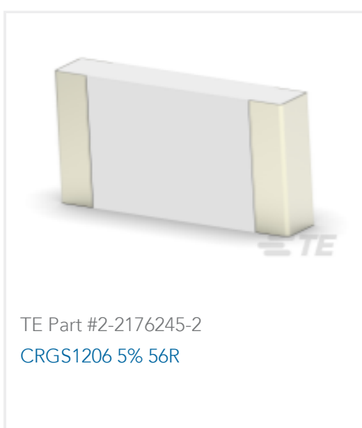
TE Part #2-2176245-2 CRGS1206 5% 56R