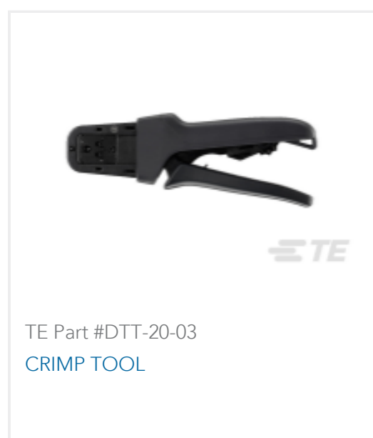
TE Part #DTT-20-03 CRIMP TOOL