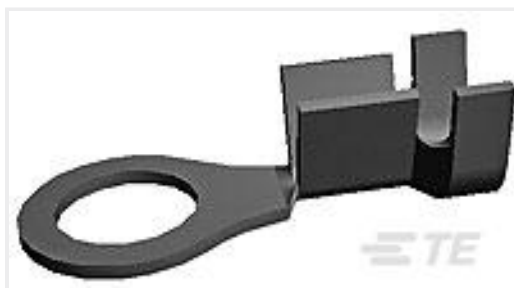
TE Part #160101-2 RING TONGUE 20-16 AWG 0.0253 TPBR