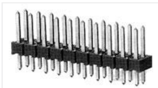
TE Part #9-146257-0 80 MODII HDR DRST B/A .100CL LF