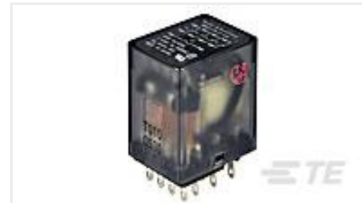
TE Part #7-1393122-1 KHAU-17D16-24=KH