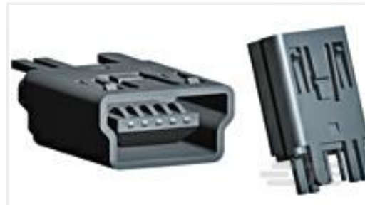
TE Part #2041517-1 MINI USB, RCPT, V/T, DIP, B TYPE, 30u" Au