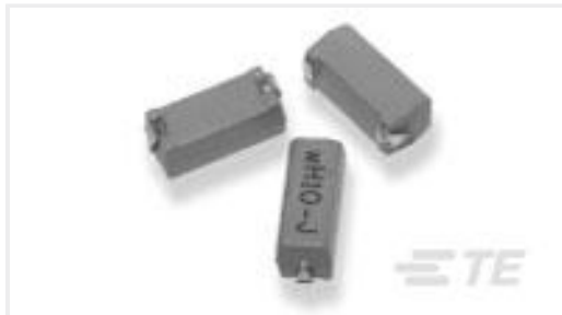
TE Part #1-1624097-0 3615A-10-3521-10 4.7UH