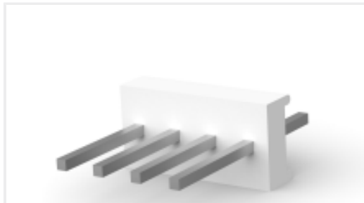
TE Part #CAT-104MTA-PVUNH PCB Header: Polyester, Vertical, Unshrouded, No Mating Alignment