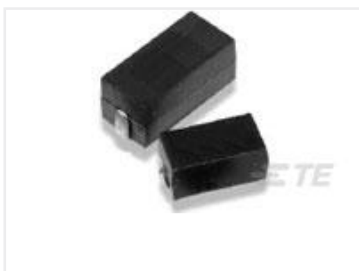
TE Part #6-1879233-5 SMW5 47R 5%