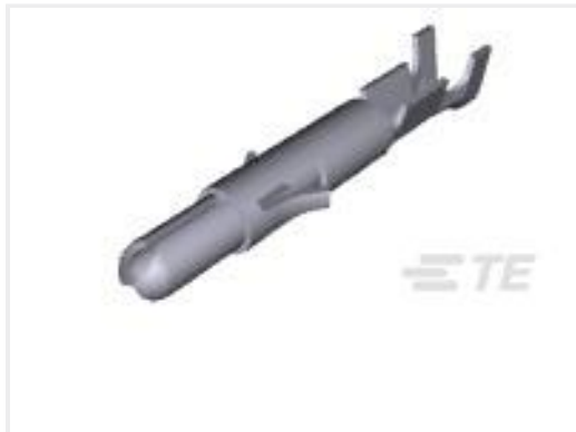
TE Part #350699-1 UMN L SPLIT PIN PTPBR