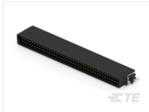
TE Part #154767-E SMCB 80 M AB VV 7-03 CL * 0007 137 E004