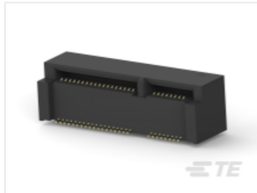
TE Part #1759513-1 0.8MM MINI PCI EXPRESS CONNECTOR 9H