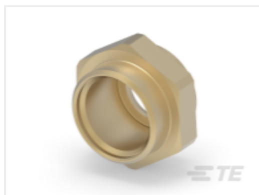
TE Part #254152-E M12 METAL SHELL, FEMALE, VERT, 9MM