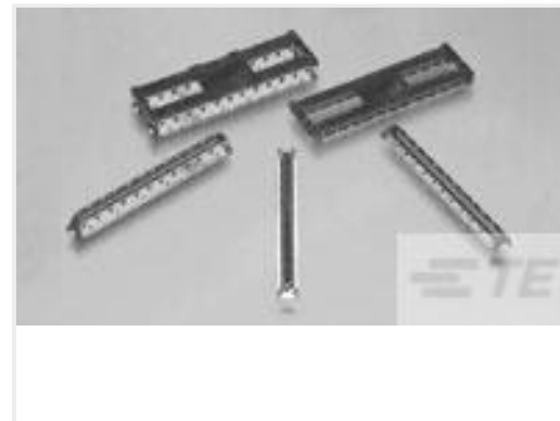
TE Part #3-1827253-6 .5FHP05H,220,S,GIG,08/Sn,HT,NSYes