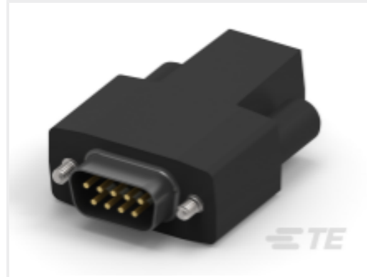
TE Part # 1-747944-5 09 SHLDG ENCL PLUG, LEAD FREE