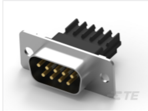
TE Part # CAT-AM7-248H3 IDC D-Sub: Plug Assembly, Wire to Wire, Signal, 2.77 mm