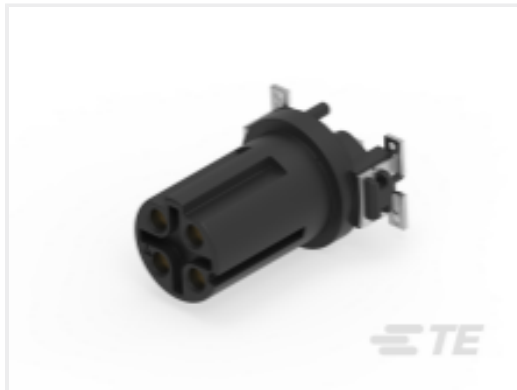
TE Part #454949-E M12 FEMALE, D CODE, 4P, 17MM SMT