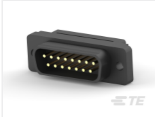
TE Part # CAT-AM7-H3 IDC D-Sub: Plug Assembly, Low Profile, Signal, 2.77 mm