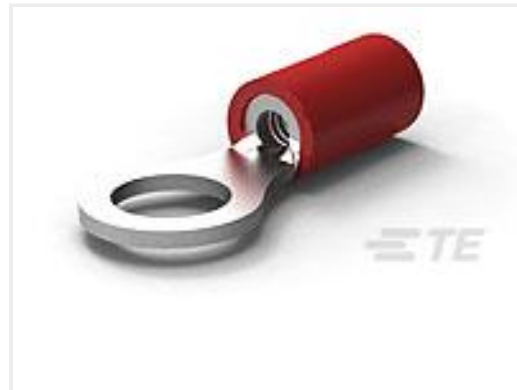
TE Part #130014 TERM, R, PG, 22-16, M5