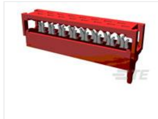
TE Part #215083-6 MICRO-MATCH MOW.06P