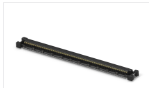
TE Part #2357739-1 16G,05FH,REC,220PIN,4H,Hard Tray