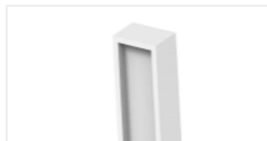
TE Part #3-1623789-6 SQM7 22R 5% (NiCr WIRE)