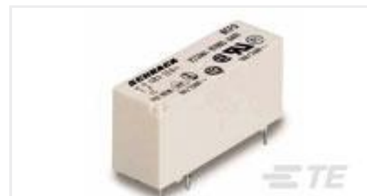
TE Part #1-1393223-4 V23061B1006A501=MINISTARKSTROM