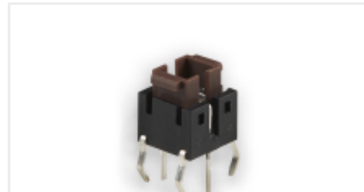
TE Part #4-2213818-2 6X6 ILL TACT THT 260GF HI PURE GREEN