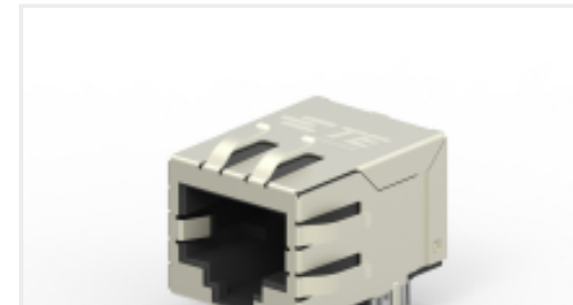
TE Part #2301994-7 RJ45 JACK INT.MAG. 1GB 1X1