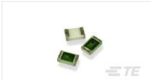
TE Part #1879208-1 CPF 0402 10R 0.1% 25PPM 1K RL