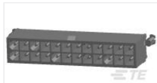
TE Part #1-794072-0 24P MINI UMNL HDR W/DH SN