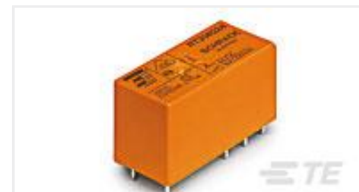
TE Part #1-1393243-5 RTE24524