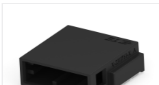
TE Part #2311714-1 6POS, TAB0.5X0.4, HDR ASSY, 90DEG, COD A