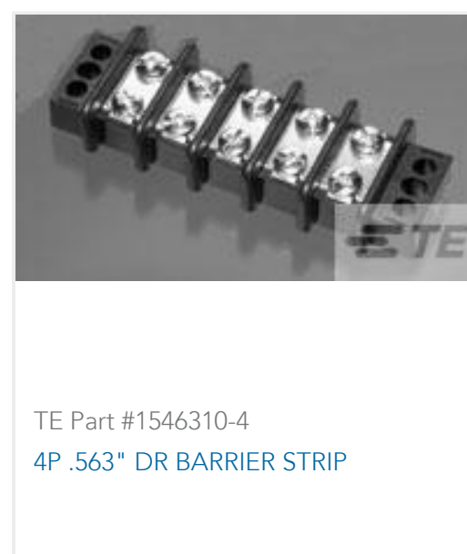
TE Part #1546310-4 4P .563" DR BARRIER STRIP