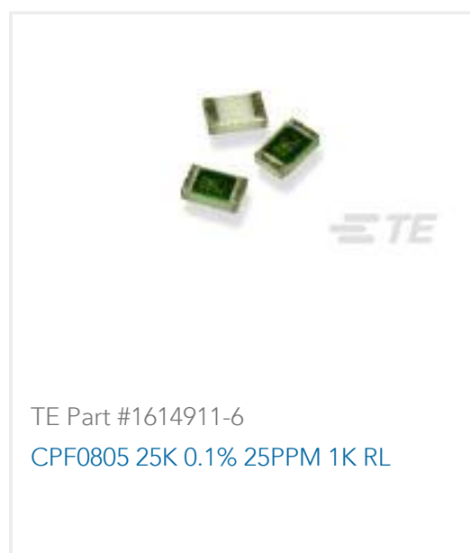
TE Part #1614911-6 CPF0805 25K 0.1% 25PPM 1K RL