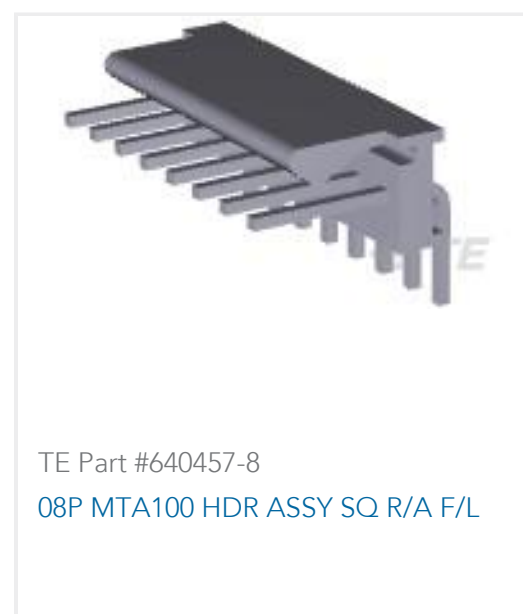
TE Part #640457-8 08P MTA100 HDR ASSY SQ R/A F/L