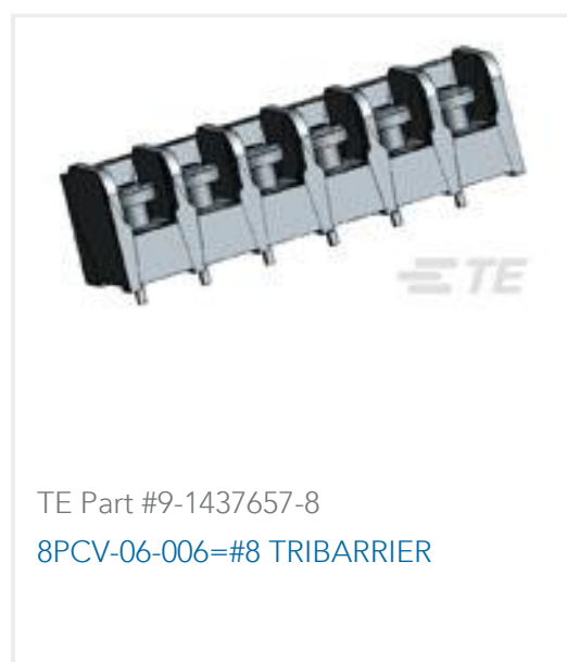
TE Part #9-1437657-8 8PCV-06-006=#8 TRIBARRIER