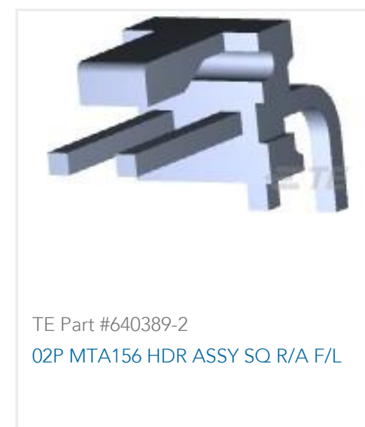
TE Part #640389-2 02P MTA156 HDR ASSY SQ R/A F/L