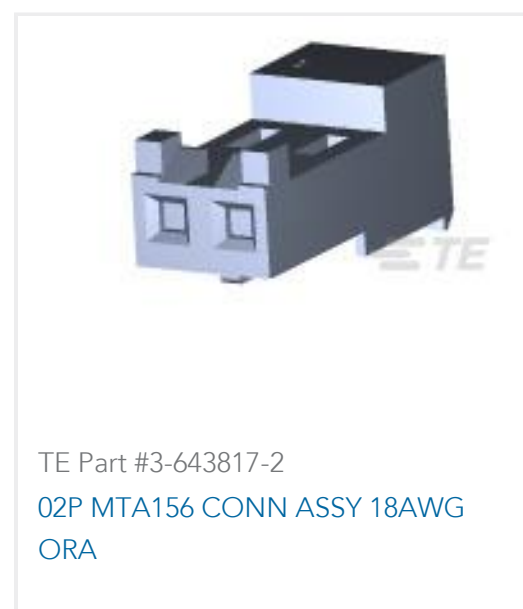
TE Part #3-643817-2 02P MTA156 CONN ASSY 18AWG ORA