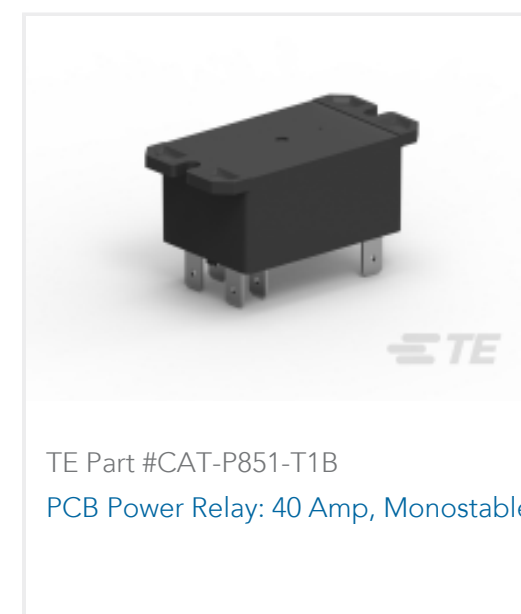
TE Part #CAT-P851-T1B PCB Power Relay: 40 Amp, Monostable