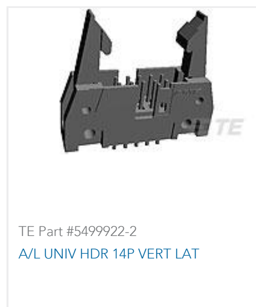
TE Part #5499922-2 A/L UNIV HDR 14P VERT LAT