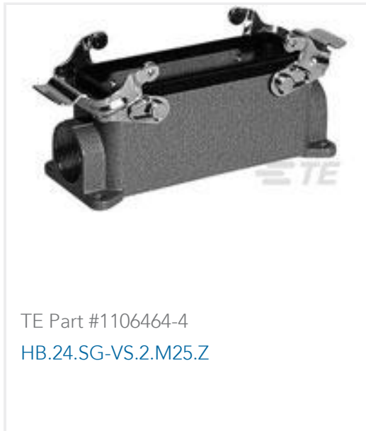
TE Part #1106464-4 HB.24.SG-VS.2.M25.Z