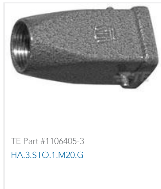
TE Part #1106405-3 HA.3.STO.1.M20.G