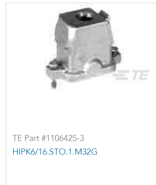
TE Part #1106425-3 HIPK6/16.STO.1.M32G