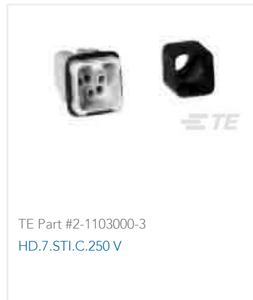
TE Part #2-1103000-3 HD.7.STI.C.250 V