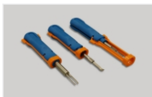
Insertion & Extraction Tools(5)