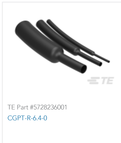
TE Part #5728236001 CGPT-R-6.4-0