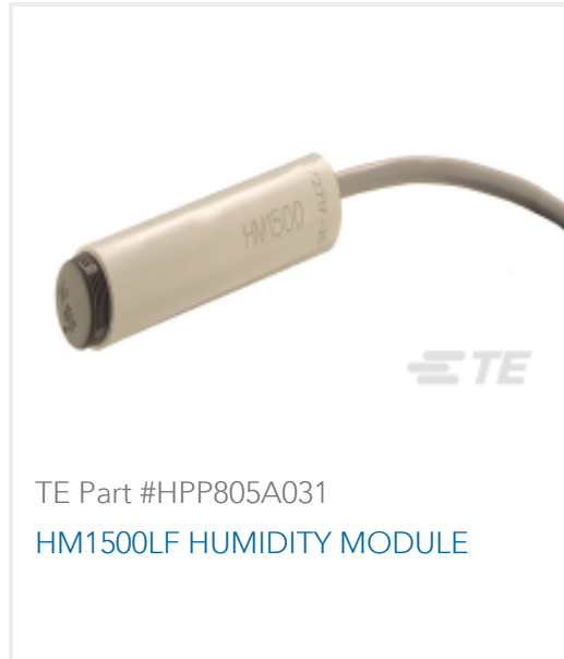
TE Part #HPP805A031 HM1500LF HUMIDITY MODULE