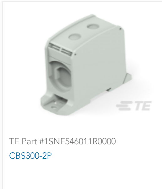
TE Part #1SNF546011R0000 CBS300-2P