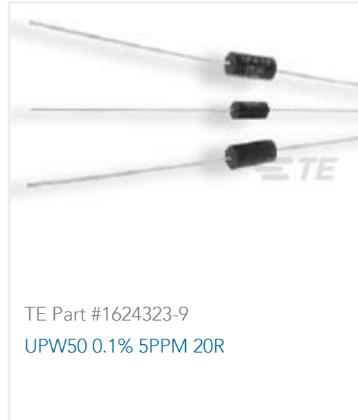
TE Part #1624323-9 UPW50 0.1% 5PPM 20R