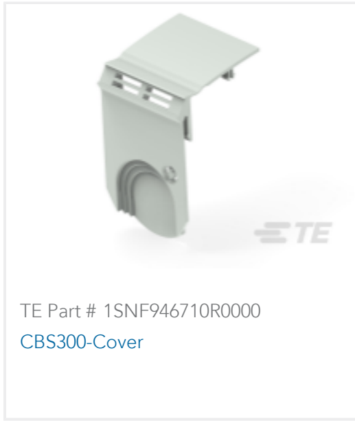
TE Part # 1SNF946710R0000 CBS300-Cover