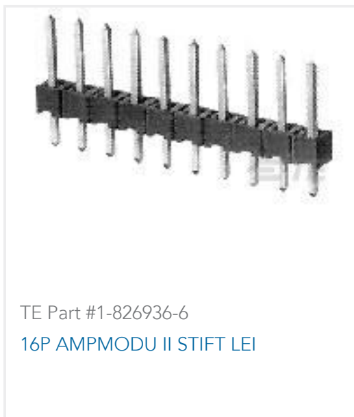
TE Part #1-826936-6 16P AMPMODU II STIFT LEI