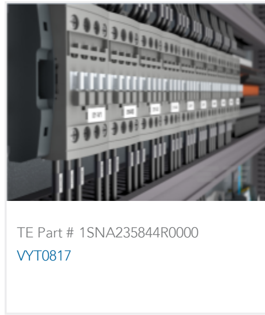
TE Part # 1SNA235844R0000 VYT0817