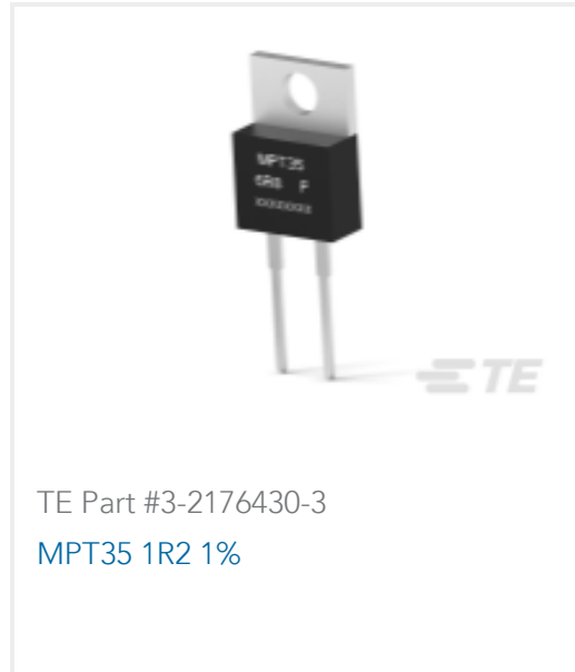
TE Part #3-2176430-3 MPT35 1R2 1%