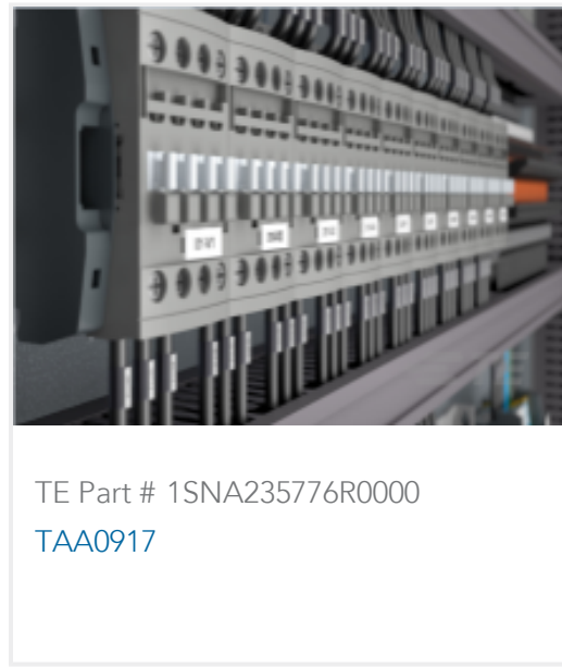
TE Part # 1SNA235776R0000 TAA0917