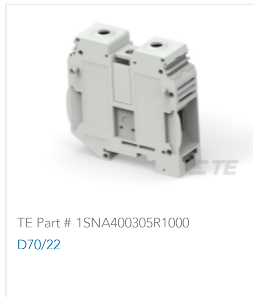
TE Part # 1SNA400305R1000 D70/22