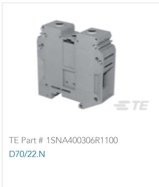
TE Part # 1SNA400306R1100 D70/22.N