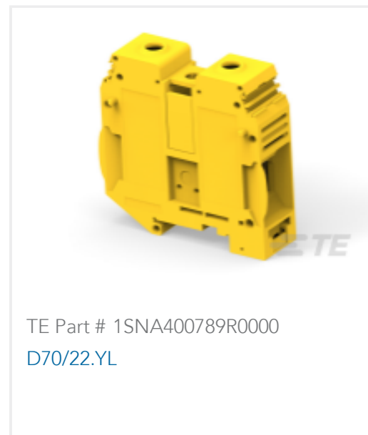
TE Part # 1SNA400789R0000 D70/22.YL