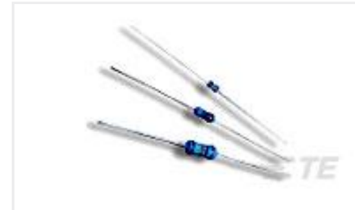
TE Part #1622406-1 LR1 1% 270R