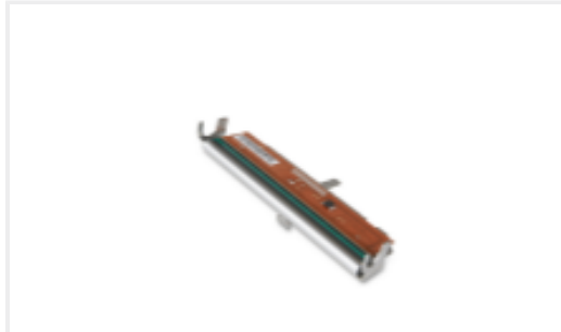
TE Part #EC8927-000 T200-PRINthead