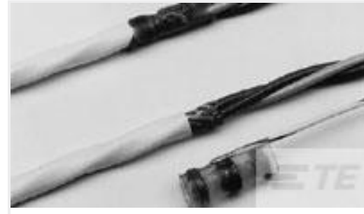
TE Part #D42180-000 B-155-05