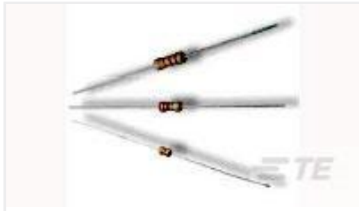
TE Part #2-1623932-4 CFR50 5% 150R