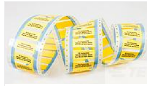
TE Part #8350110001 TMS-SCE-1/8-2.0-9