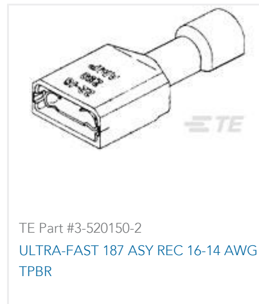
TE Part #3-520150-2 ULTRA-FAST 187 ASY REC 16-14 AWG TPBR