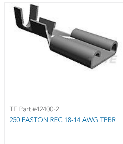
TE Part #42400-2 250 FASTON REC 18-14 AWG TPBR