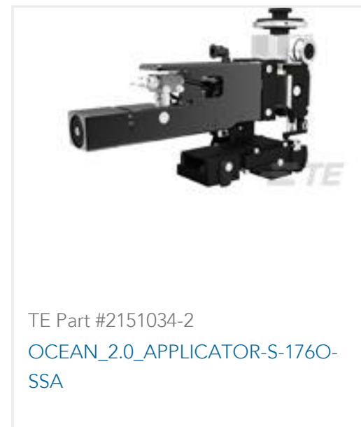
TE Part #2151034-2 OCEAN_2.0_APPLICATOR-S-176O- SSA