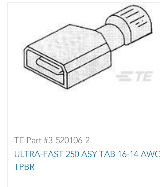
TE Part #3-520106-2 ULTRA-FAST 250 ASY TAB 16-14 AWG TPBR