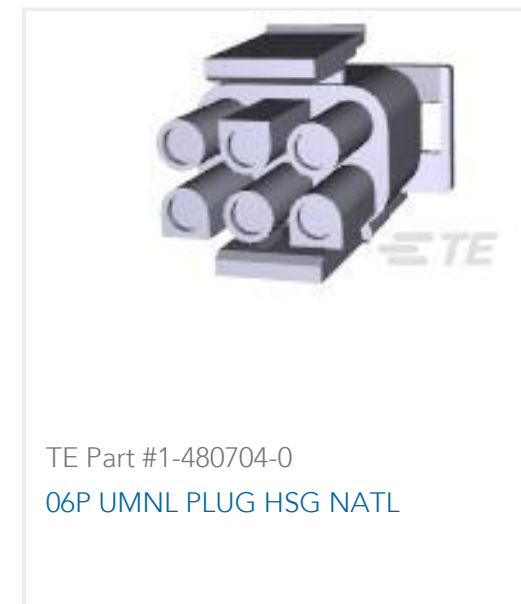
TE Part #1-480704-0 06P UMNL PLUG HSG NATL