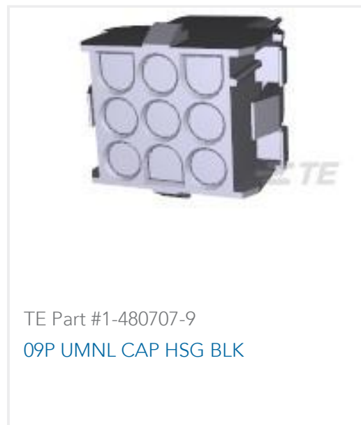
TE Part #1-480707-9 09P UMNL CAP HSG BLK