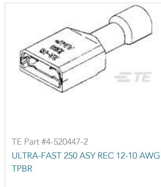
TE Part #4-520447-2 ULTRA-FAST 250 ASY REC 12-10 AWG TPBR