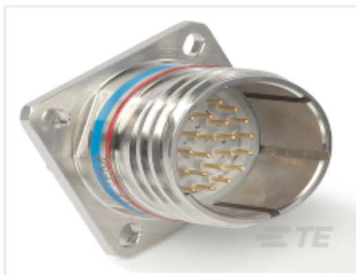
TE Part #CAT-D38999-DTS6L D38999: Square Flange, 13-04 insert