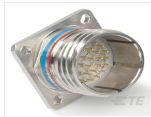
TE Part #CAT-D38999-DTS70 D38999: Square Flange, 25-19 insert