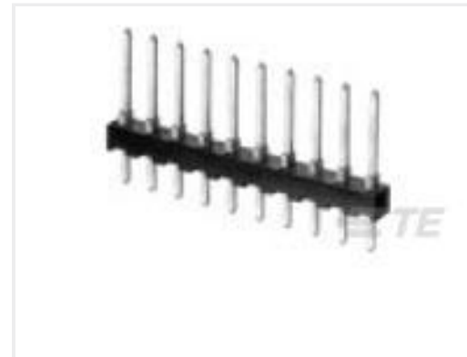
TE Part #87220-4 04 MODII HDR SRST UNSHRD .100