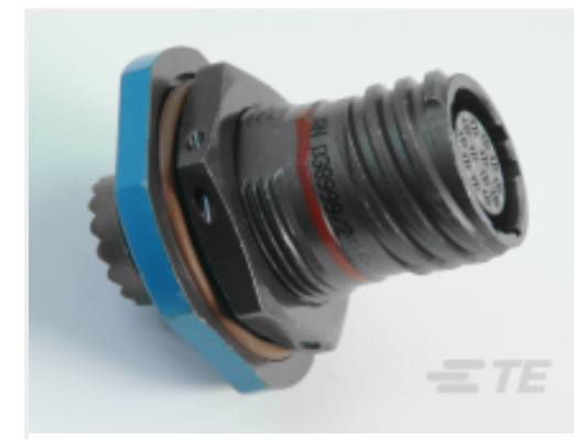
TE Part #YDTS24F25-19SNV001 RECP ASSY