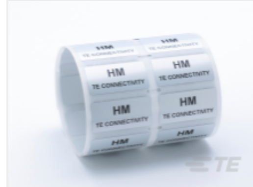
TE Part #CAT-T3437-H648 HM High Tack Metalized Polyester Labels