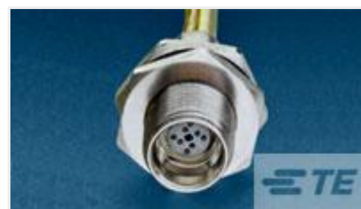
TE Part #1925259-1 QCM008SC1TT036PBC = Circular