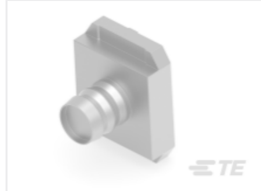
TE Part #1-2308348-7 CRIMP FLANGE 7 LARGE