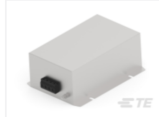
TE Part #1-1609968-6 KEF 36A 1S HIGH PLUS SP WYE 440VAC