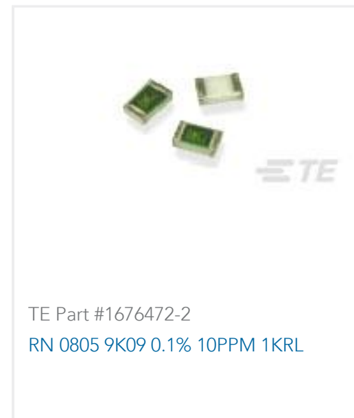
TE Part #1676472-2 RN 0805 9K09 0.1% 10PPM 1KRL