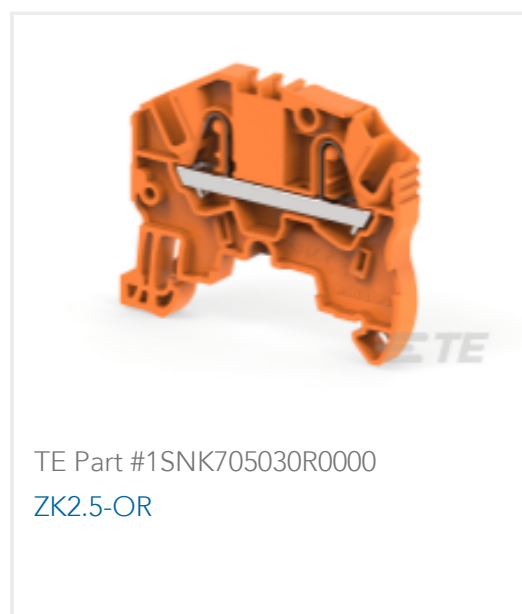
TE Part #1SNK705030R0000 ZK2.5-OR