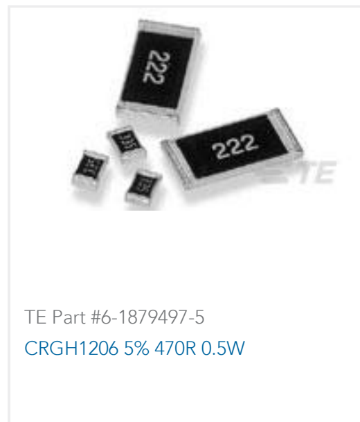
TE Part #6-1879497-5 CRGH1206 5% 470R 0.5W