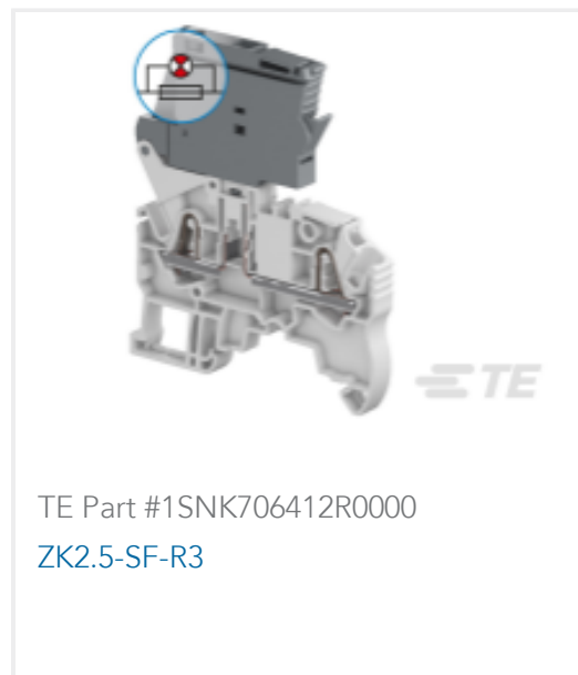
TE Part #1SNK706412R0000 ZK2.5-SF-R3