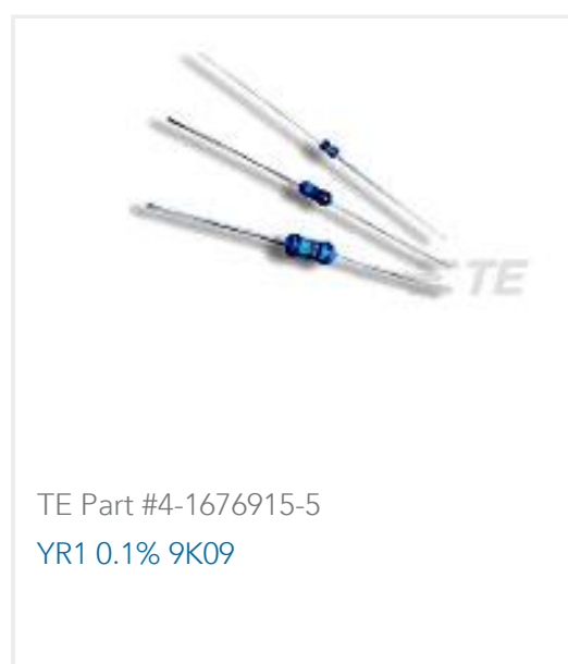
TE Part #4-1676915-5 YR1 0.1% 9K09