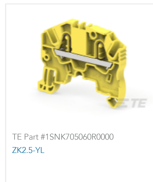
TE Part #1SNK705060R0000 ZK2.5-YL