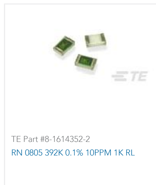
TE Part #8-1614352-2 RN 0805 392K 0.1% 10PPM 1K RL