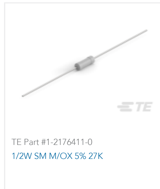
TE Part #1-2176411-0 1/2W SM M/OX 5% 27K