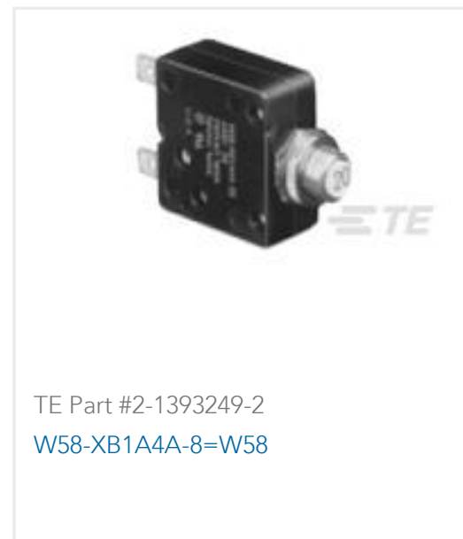
TE Part #2-1393249-2 W58-XB1A4A-8=W58