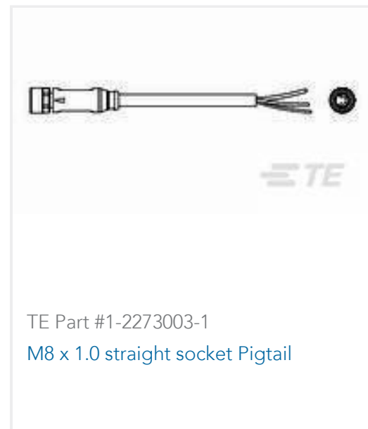
TE Part #1-2273003-1 M8 x 1.0 straight socket Pigtail