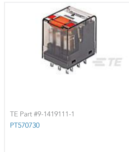
TE Part #9-1419111-1 PT570730