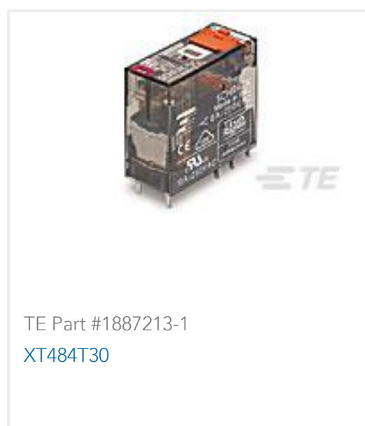
TE Part #1887213-1 XT484T30