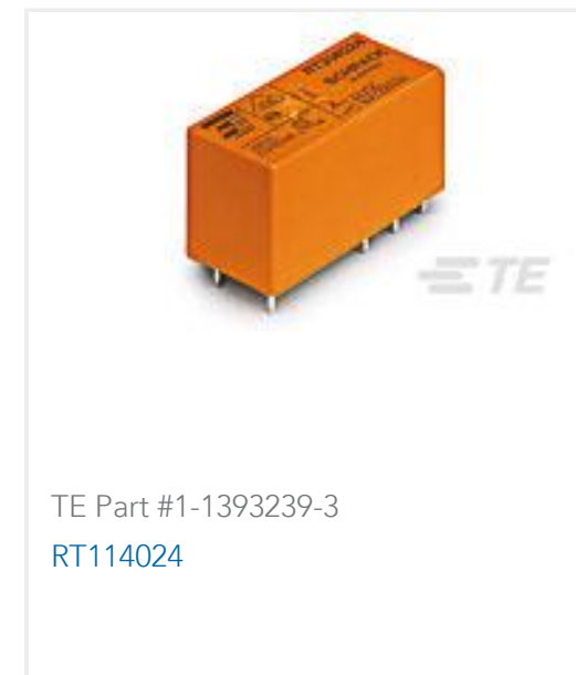
TE Part #1-1393239-3 RT114024