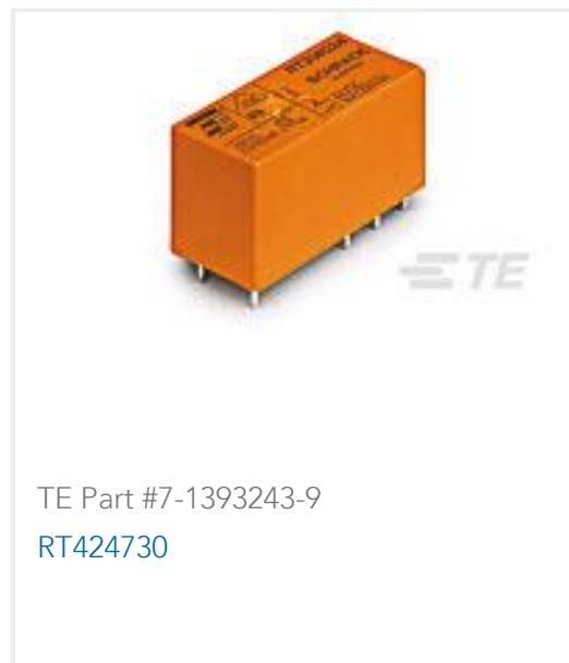
TE Part #7-1393243-9 RT424730