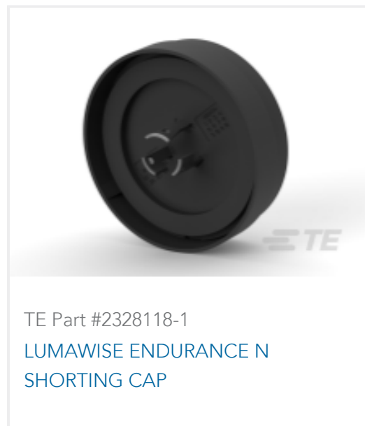
TE Part #2328118-1 LUMAWISE ENDURANCE N SHORTING CAP