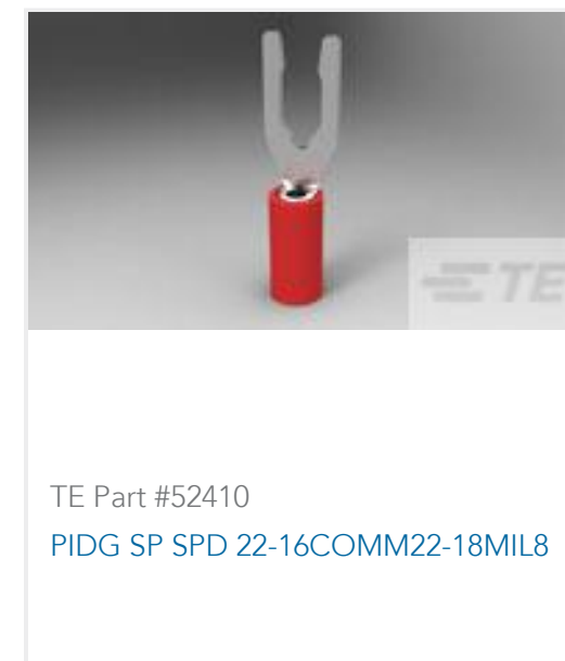
TE Part #52410 PIDG SP SPD 22-16COMM22-18MIL8