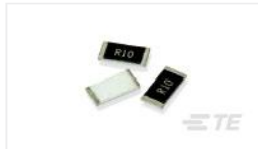
TE Part #2-2176056-6 RLP73K 2B R11 5% 5K RL