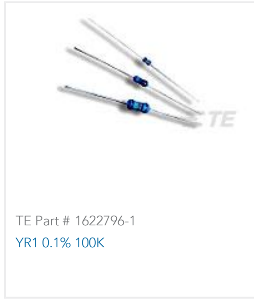
TE Part # 1622796-1 YR1 0.1% 100K