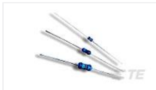
TE Part #7-1879026-7 YR1 0.1% 422K