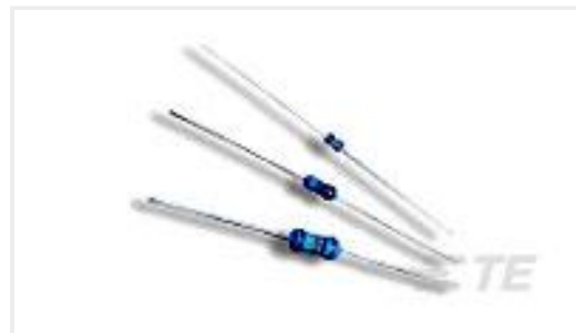
TE Part #1622433-1 LR1 1% 30K1