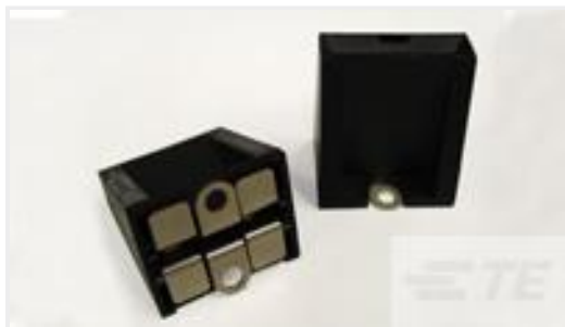
TE Part #1643903-1 CROWN CLIP Senior II 538-0068-00100