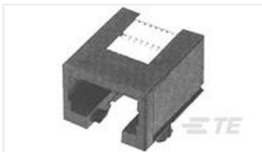
TE Part #215876-2 6/4 PCB MOD.JACK SE