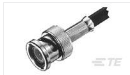
TE Part #5221128-1 PLUG,COMMERCIAL BNC