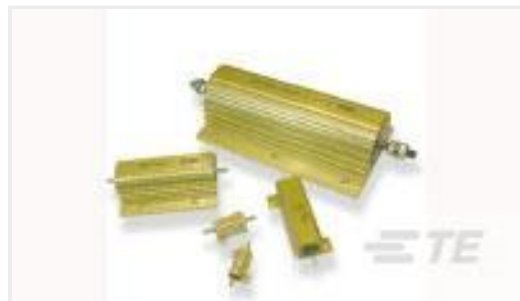
TE Part #2-1630024-9 HSC250 150R 5%