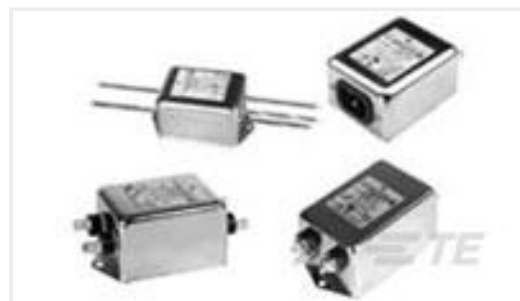
TE Part #1-6609031-3 10ER1=F7189