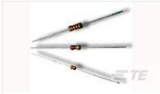
TE Part #1623927-2 CFR16 5% 100R