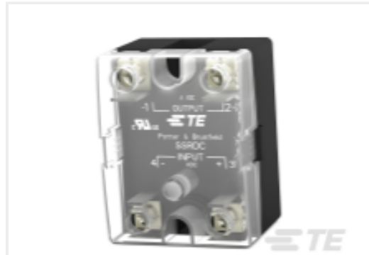
TE Part #2330274-3 SSRDC-200D40 = Hokey Puck,40A, 200V DC