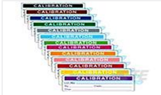
TE Part #1878661-1 QCC306GR