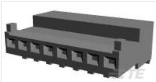
TE Part #3-643814-8 08P MTA100 CONN ASSY POL RIB