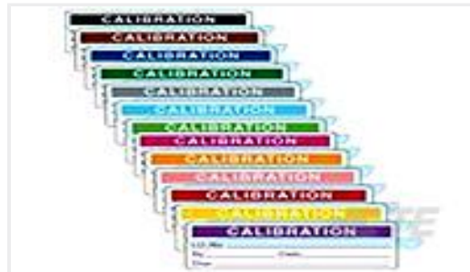
TE Part #1878661-1 QCC306GR