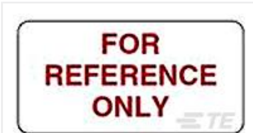
TE Part #1878645-2 MAM136