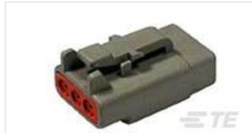
TE Part #DTM06-3S PLG, 3P, GRY, N