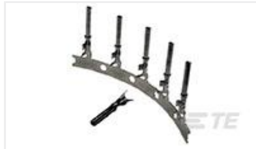
TE Part #1062-20-0122 SOC, SF, SIZE 20, 16-22, NI/NI