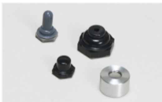
Switch Seals & Accessories(8)