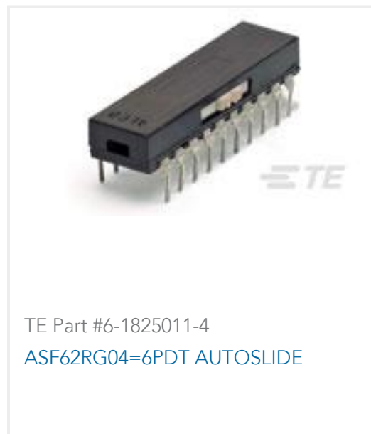
TE Part #6-1825011-4 ASF62RG04=6PDT AUTOSLIDE