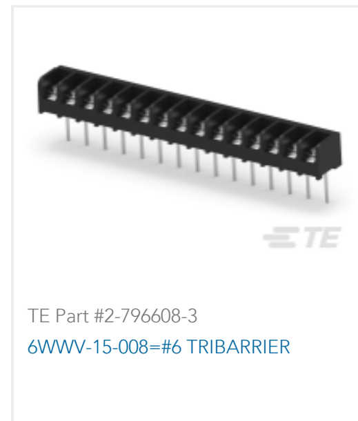
TE Part #2-796608-3 6WWW-15-008=#6 TRIBARRIER