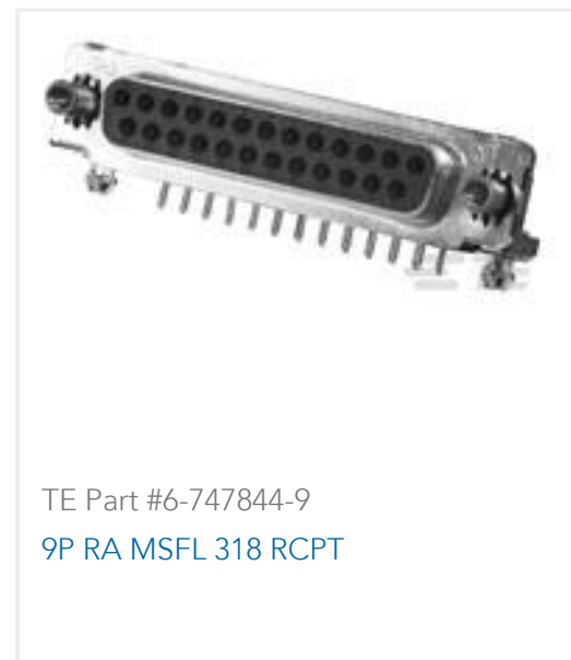
TE Part #6-747844-9 9P RA MSFL 318 RCPT