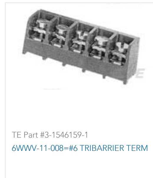
TE Part #3-1546159-1 6WWW-11-008=#6 TRIBARRIER TERM