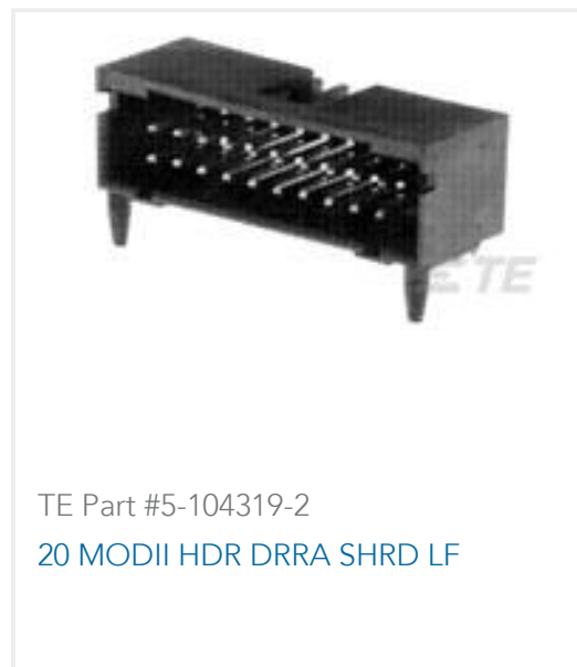
TE Part #5-104319-2 20 MODII HDR DRRR SHRDLF