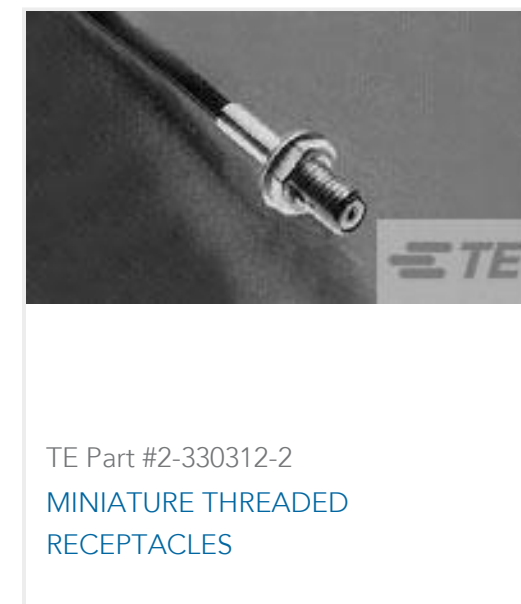
TE Part #2-330312-2 MINIATURE THREADED RECEPTACLES