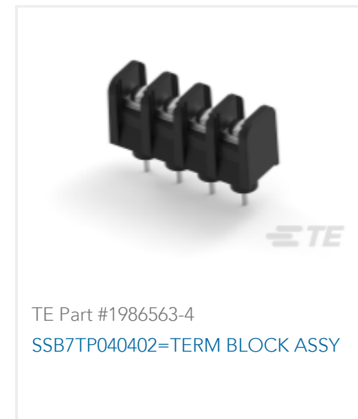
TE Part #1986563-4 SSB7TP040402=TERM BLOCK ASSY