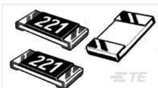
TE Part #7-2176070-3 3521 10K 1% 2W