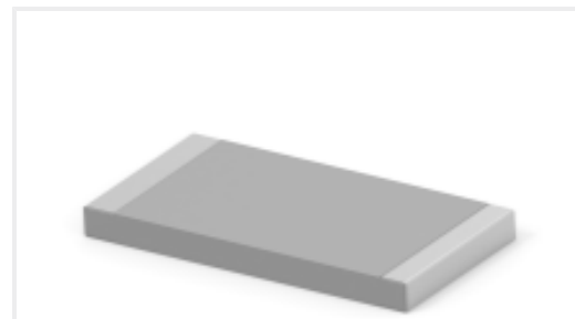
TE Part #1-2176331-8 CRGP 2512 270R 1%