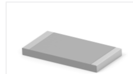
TE Part #2176331-6 CRGP 2512 27R 1%