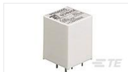
TE Part #9-1415029-1 PB114024