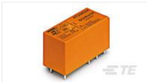
TE Part #1419108-6 RT214730