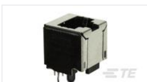
TE Part #6368150-3 MJ,TE,8P,CAT5,SHIELDED