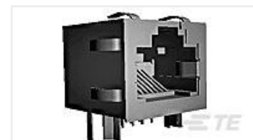
TE Part #1-406541-1 MJ,INV,1X1,6PNL G.,100"ST,SN"