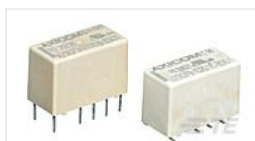
TE Part #5-1393788-7 V23079D1003B301