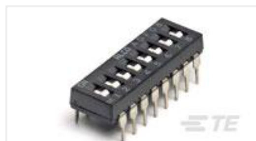
TE Part #1-1825059-2 ADF03STTR04=DIP S,FLUSH,SMT-GW