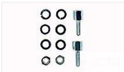
TE Part #5205817-3 FEMALE SCREWLOCK KIT