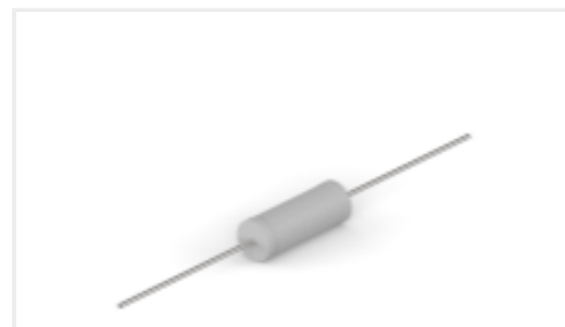
TE Part #2-2176412-5 5W XSM M/OX 5% 51R