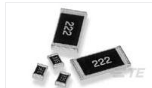
TE Part #6-1879497-7 CRGH1206 5% 560R 0.5W