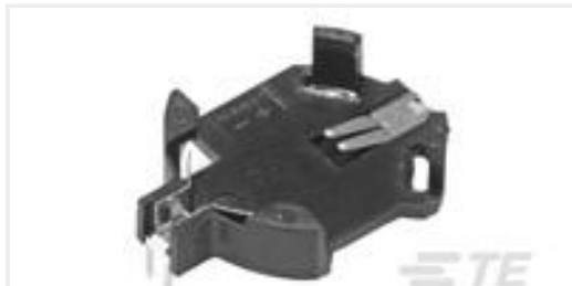
TE Part #120591-1 TOP LOAD BATTERY