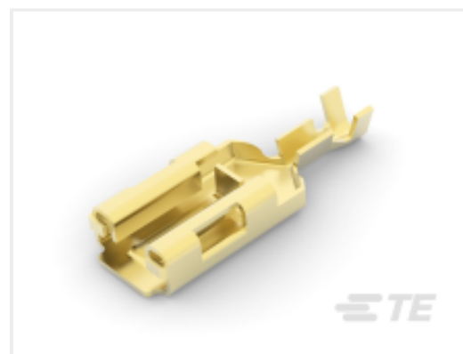
TE Part # 170452-1 PL 250 AM REC 22-20 AWG 0.406 X 21 BR