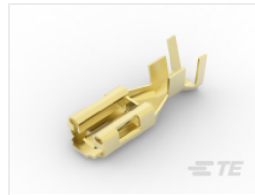
TE Part # 170456-1 PL 250 AUTOMOTIVE REC 12-10 0.40 X 21 BR