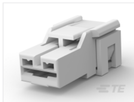
TE Part # 172863-1 250 POSITIVE DBL LOCK 1P