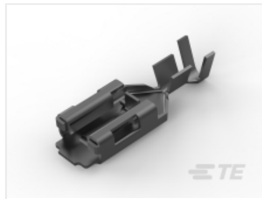
TE Part # 170454-2 PL 250 AM REC 18-14 0.40 X 21 PRE-TPBR