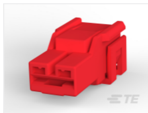
TE Part # 172863-8 250 P.LOCK MK-II 1P HSG RED