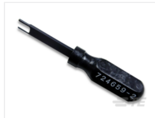
TE Part # 724659-2 EXT TOOL FOR POSITIVE .250