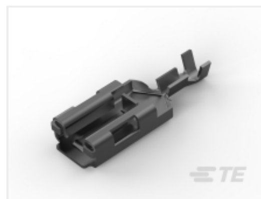
TE Part # 170452-2 PL 250 AUTOMOTIVE REC 22-20 AWG PRE TPBR