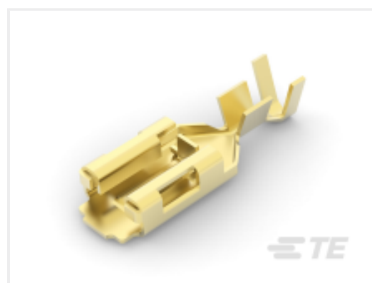
TE Part # 170454-1 PL 250 AUTOMOTIVE REC 18-14 0.40 X 21 BR