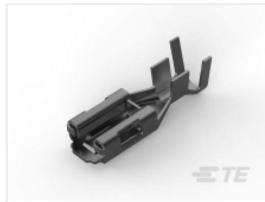
TE Part # 170456-2 PL 250 AM REC 12-10 0.40 X 21 PRE-TPBR