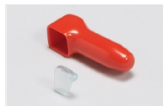
Insulation Boots & Sleeves(5)