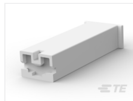
TE Part # 928083-1 PL 187 REC HSG 1P NYLON NAT