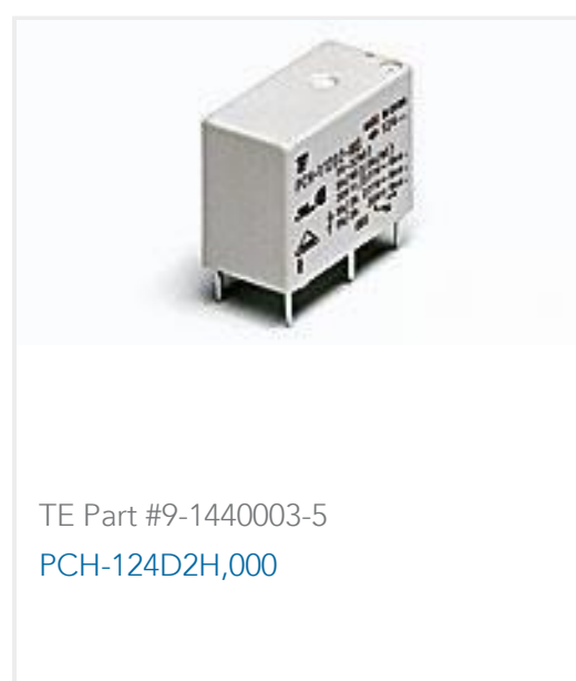
TE Part #9-1440003-5 PCH-124D2H,000