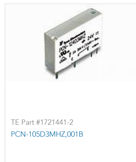
TE Part #1721441-2 PCN-105D3MHZ,001B