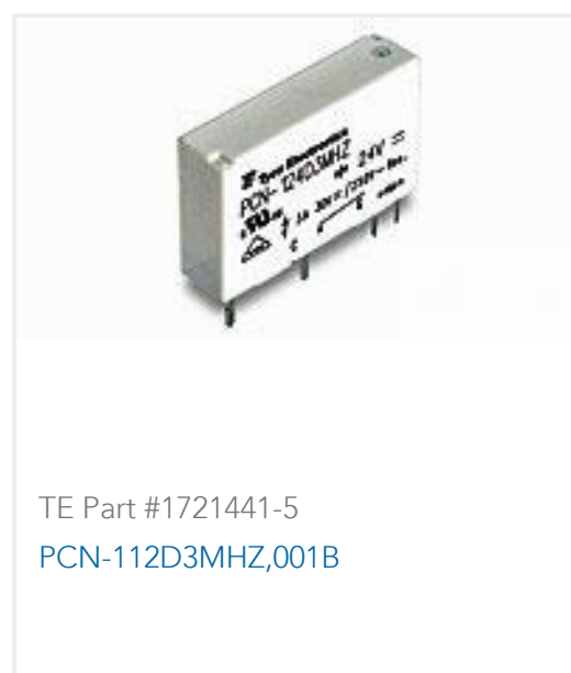
TE Part #1721441-5 PCN-112D3MHZ,001B