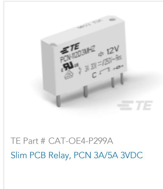
TE Part # CAT-OE4-P299A Slim PCB Relay, PCN 3A/5A 3VDC