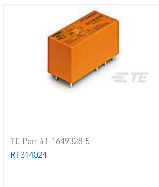
TE Part #1-1649328-5 RT314024