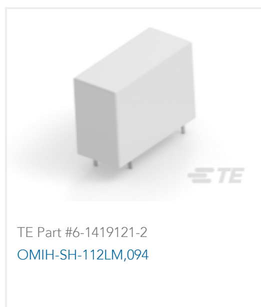
TE Part #6-1419121-2 OMIH-SH-112LM,094