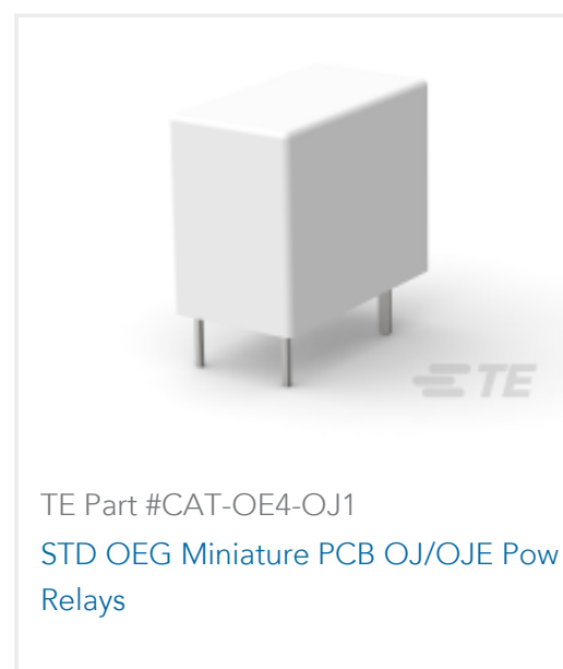
TE Part #CAT-OE4-OJ1 STD OEG Miniature PCB OJ/OJE Pow Relays