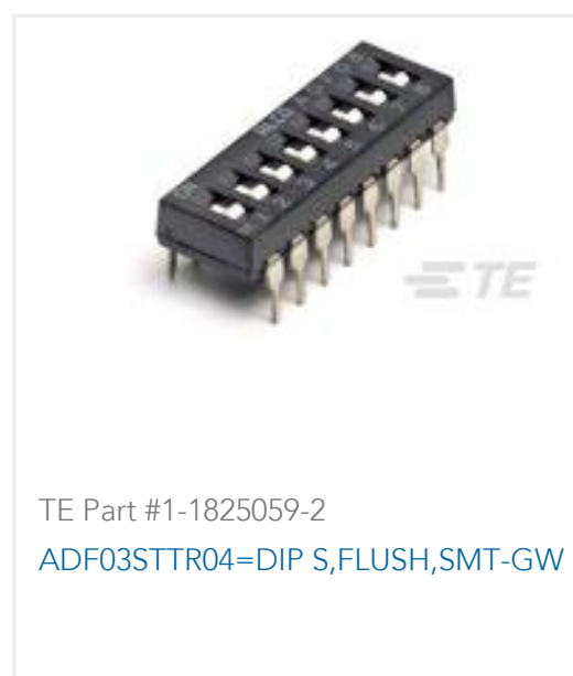
TE Part #1-1825059-2 ADF03STTR04=DIP S,FLUSH,SMT-GW