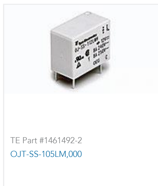
TE Part #1461492-2 OJT-SS-105LM,000