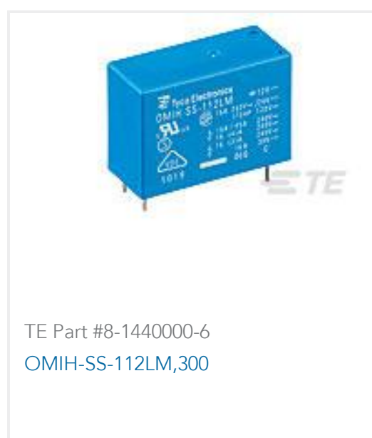
TE Part #8-1440000-6 OMIH-SS-112LM,300