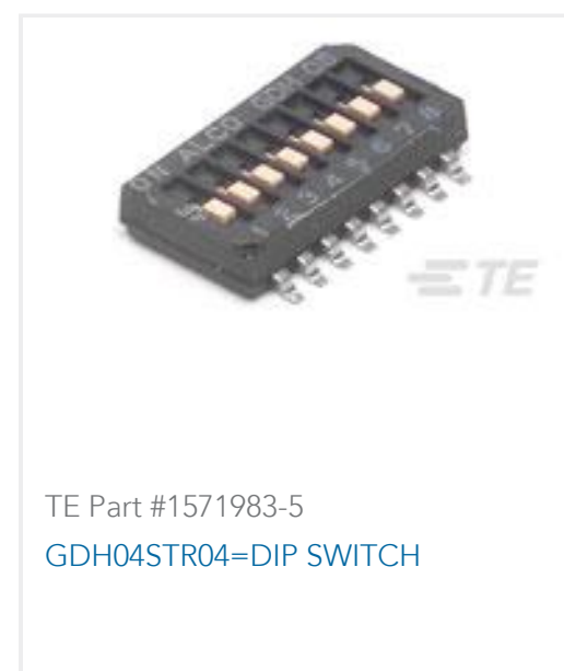
TE Part #1571983-5 GDH04STR04=DIP SWITCH