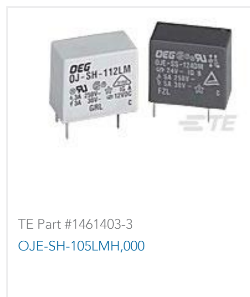
TE Part #1461403-3 OJE-SH-105LMH,000