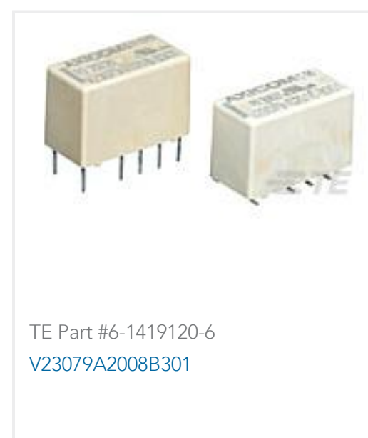
TE Part #6-1419120-6 V23079A2008B301