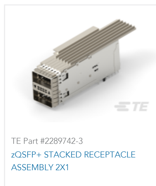
TE Part #2289742-3 zQSFP+ STACKED RECEPTACLE ASSEMBLY 2X1