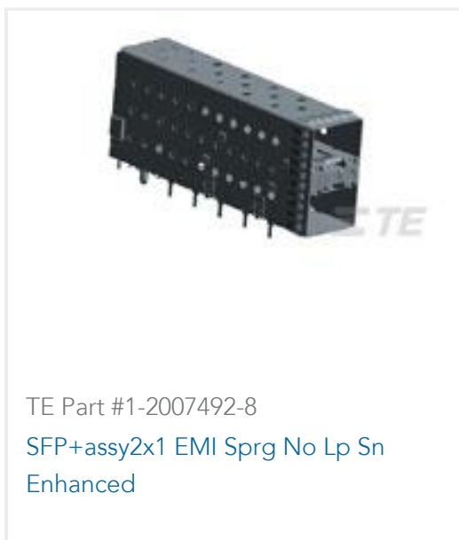
TE Part #1-2007492-8 SFP+assy2x1 EMI Sprng No Lp Sn Enhanced