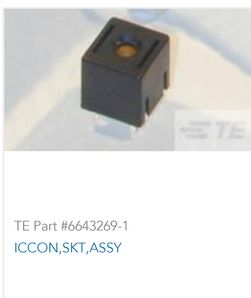
TE Part #6643269-1 ICCON,SKT,ASSY