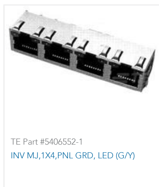
TE Part #5406552-1 INV MJ,1X4,PNL GRD, LED (G/Y)