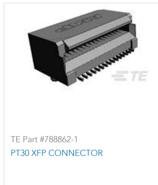
TE Part #788862-1 PT30 XFP CONNECTOR