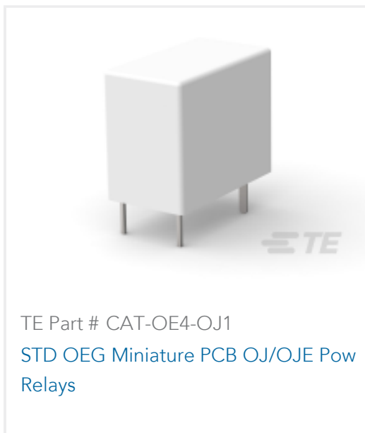
TE Part # CAT-OE4-OJ1 STD OEG Miniature PCB OJ/OJE Pow Relays