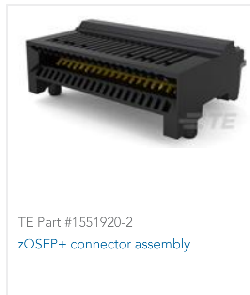
TE Part #1551920-2 zQSFP+ connector assembly