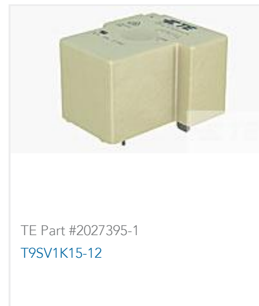
TE Part #2027395-1 T9SV1K15-12