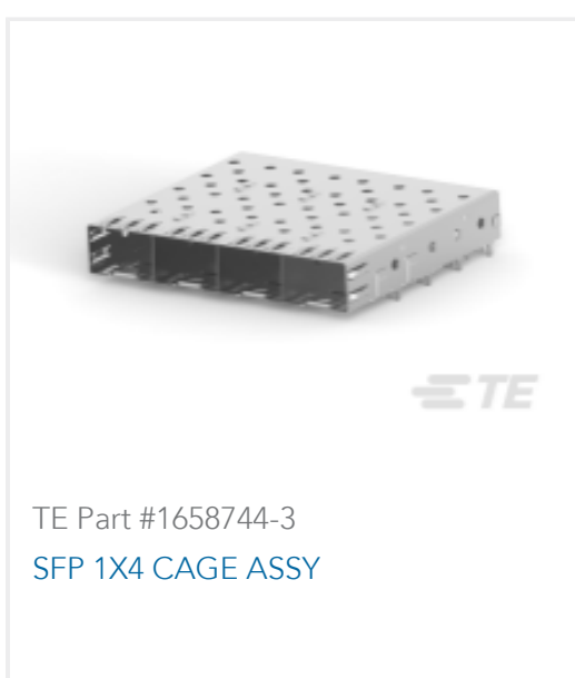
TE Part #1658744-3 SFP 1X4 CAGE ASSY