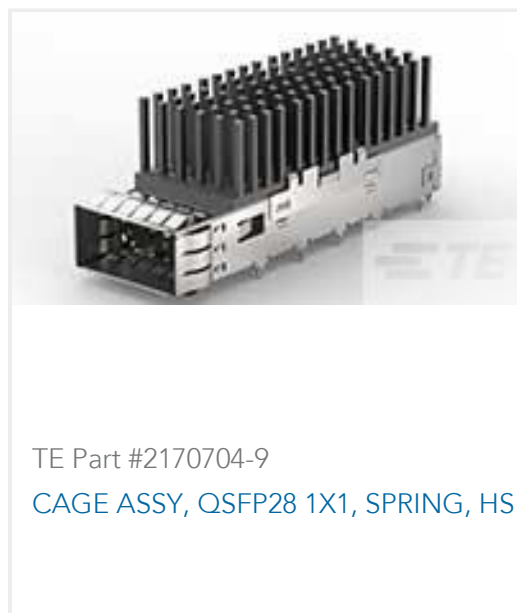
TE Part #2170704-9 CAGE ASSY, QSFP28 1X1, SPRING, HS