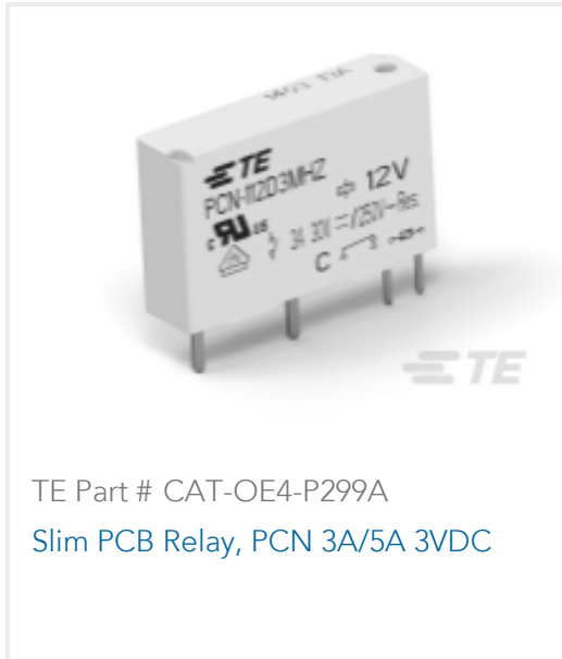
TE Part # CAT-OE4-P299A Slim PCB Relay, PCN 3A/5A 3VDC