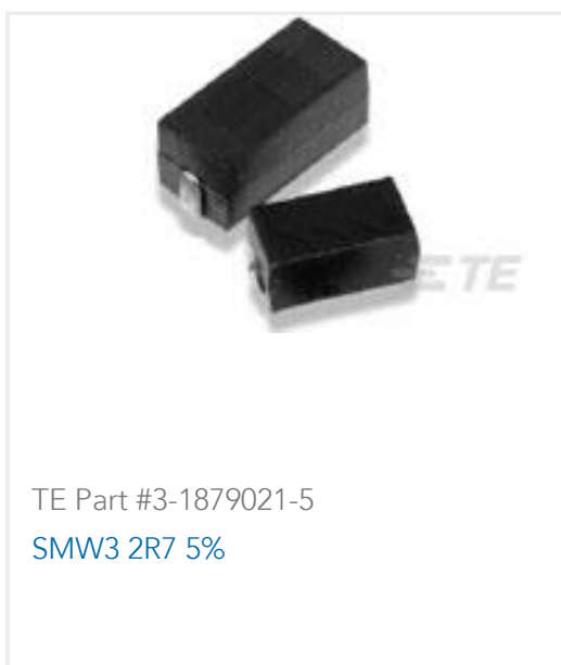
TE Part #3-1879021-5 SMW3 2R7 5%