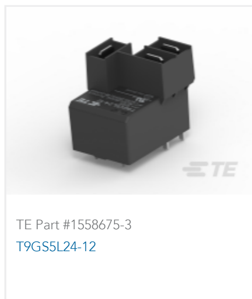
TE Part #1558675-3 T9GS5L24-12