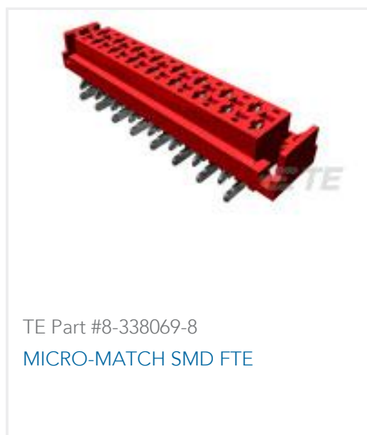
TE Part #8-338069-8 MICRO-MATCH SMD FTE