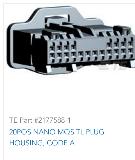
TE Part #2177588-1 20POS NANO MQS TL PLUG HOUSING, CODE A