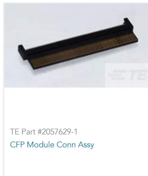
TE Part #2057629-1 CFP Module Conn Assy