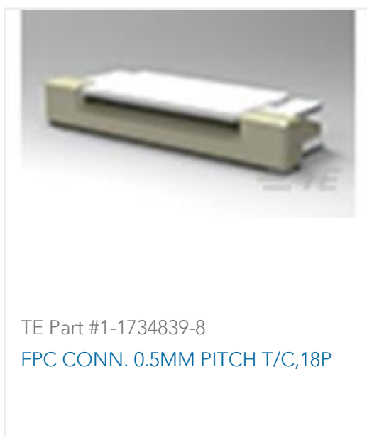
TE Part #1-1734839-8 FPC CONN. 0.5MM PITCH T/C,18P