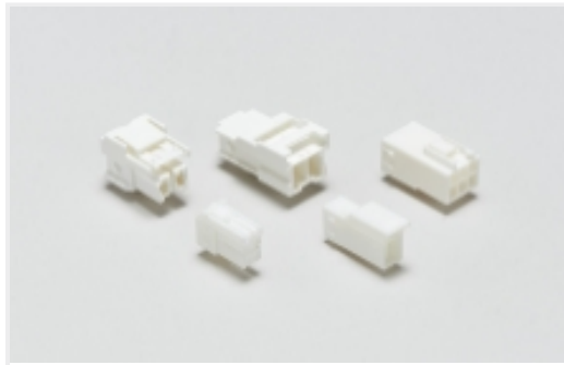
Rectangular Power Connectors(63)