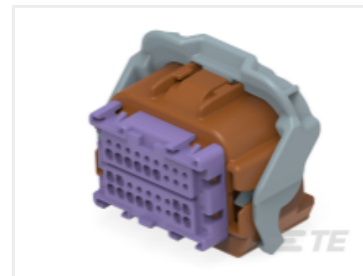
TE Part #2296316-7 ACU 36P PLUG ASSY(A1A7)