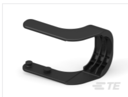
TE Part #2188496-2 LEVER HSG FOR ECU 60P PLUG BA