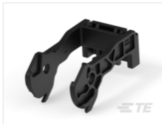
TE Part #2350341-2 025/060/110/250 HYB 51P PLUG LEVER BK