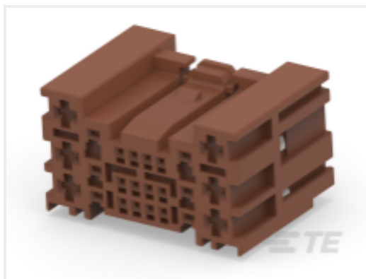
TE Part #2-2298622-1 24POS, HYBRID, REC HSG ASSY, UNSLD, COD A