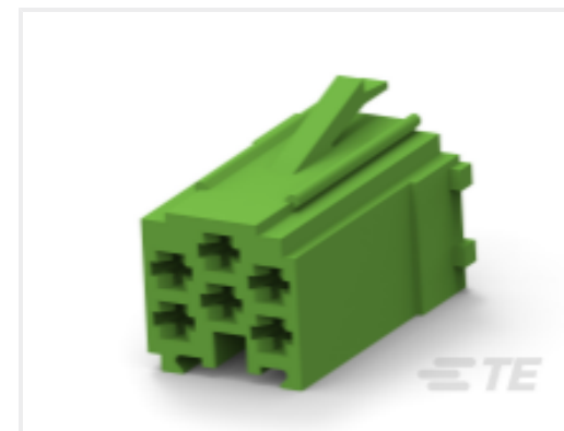
TE Part #493486-2 HSG. 6P MICROTIMER REC.