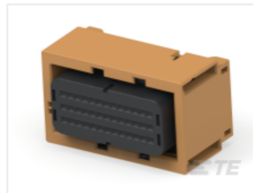
TE Part #9-1897133-8 GET 39P PLUG ASSY B9B10