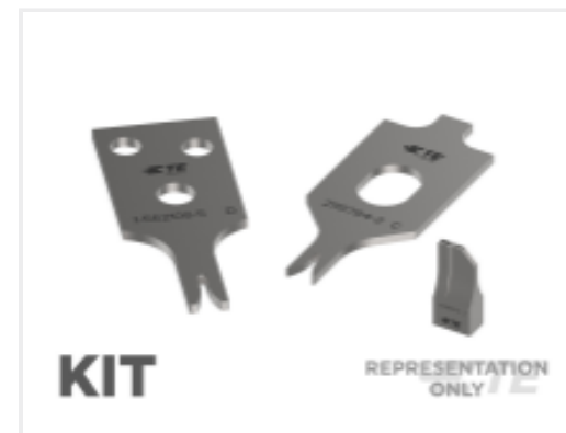
KIT REPRESENTATION ONLY TE Part # 7-2836398-7 OCEAN_2.0_SPARE_PART_KIT- 110F180F