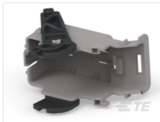
TE Part #2219008-3 025HYB 56P COVER ASSY GRY