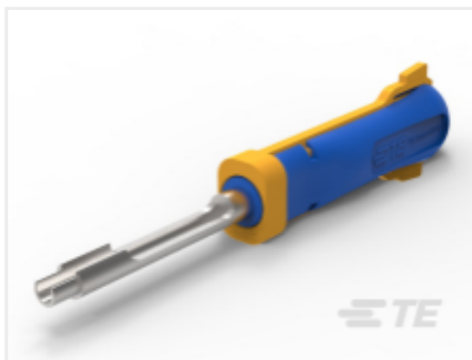
TE Part # 919147-1 EXTRACTION TOOL