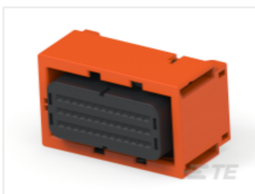
TE Part #9-1897133-7 GET 39P PLUG ASSY B8B9