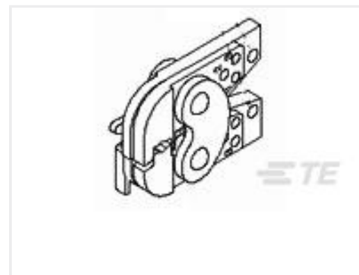
TE Part # 752940-1 CRIMPING JAW HEAD ASSY