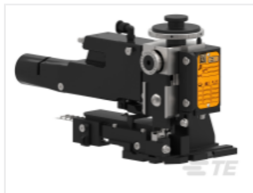
TE Part # 2836398-2 OCEAN_2.0_Applicator-S-110F180F- RSA