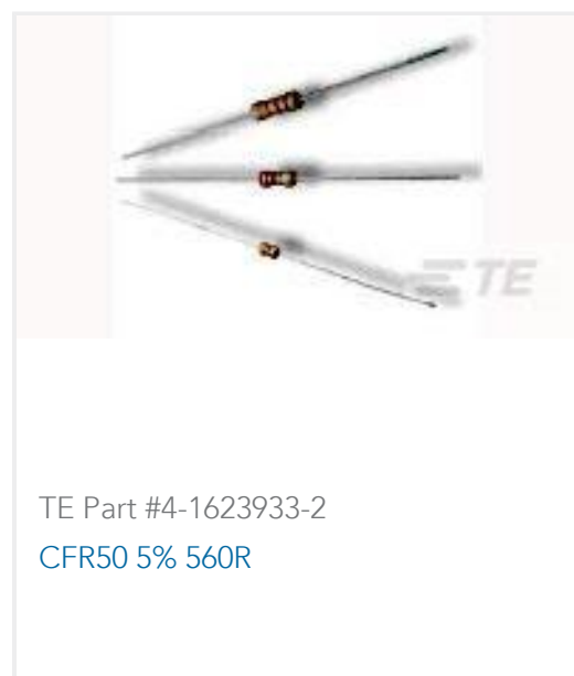
TE Part #4-1623933-2 CFR50 5% 560R