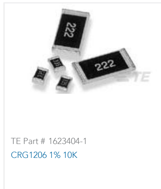
TE Part # 1623404-1 CRG1206 1% 10K