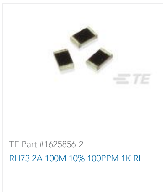
TE Part #1625856-2 RH73 2A 100M 10% 100PPM 1K RL