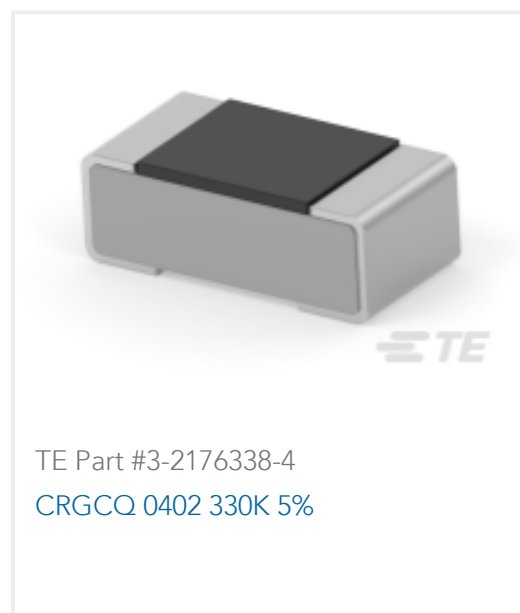
TE Part #3-2176338-4 CRGCQ 0402 330K 5%