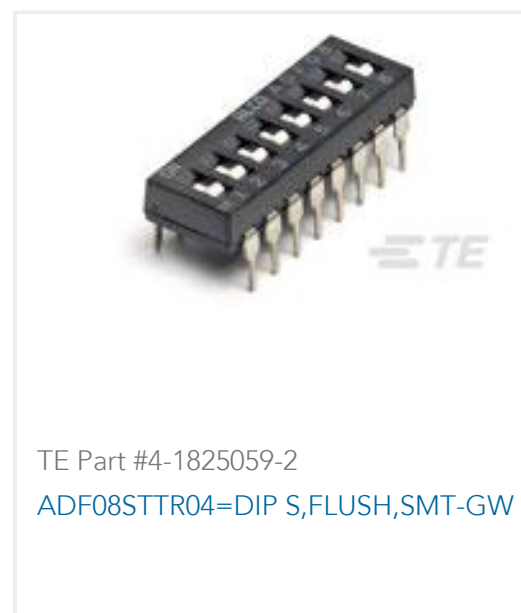
TE Part #4-1825059-2 ADF08STTR04=DIP S,FLUSH,SMT-GW