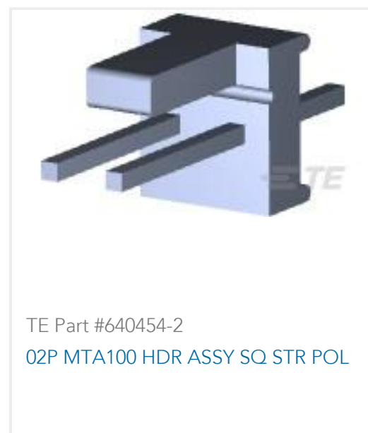
TE Part #640454-2 02P MTA100 HDR ASSY SQ STR POL