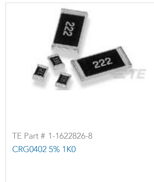
TE Part # 1-1622826-8 CRG0402 5% 1K0