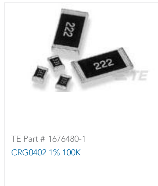
TE Part # 1676480-1 CRG0402 1% 100K