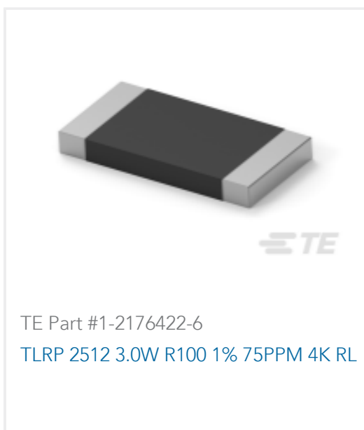
TE Part #1-2176422-6 TLRP 2512 3.0W R100 1% 75PPM 4K RL