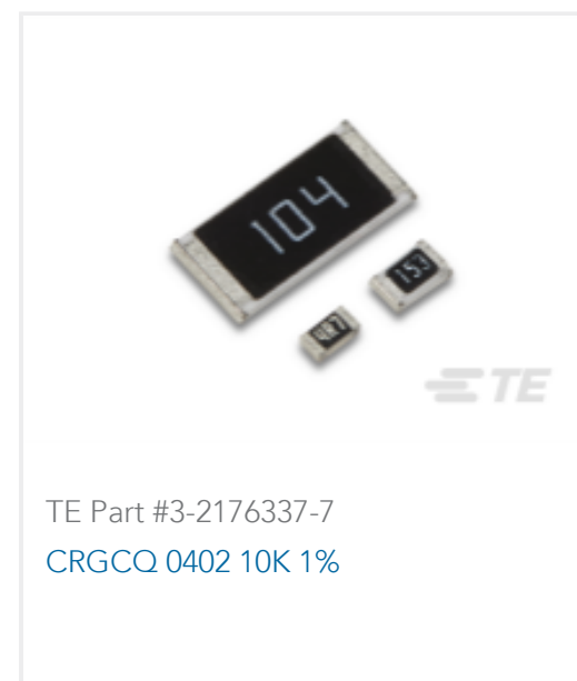
TE Part #3-2176337-7 CRGCQ 0402 10K 1%