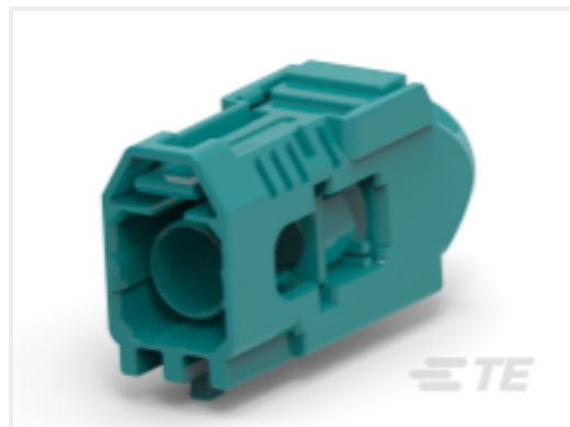
TE Part #2-2345654-0 HOUSING, INLINE FEMALE, CLIP, FAKRA