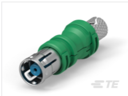
TE Part #2203274-1 CAVITY INSERT ASM, INLINE FEMALE, FAKRA