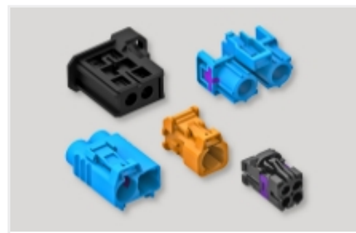
Data Connectivity Housings(525)