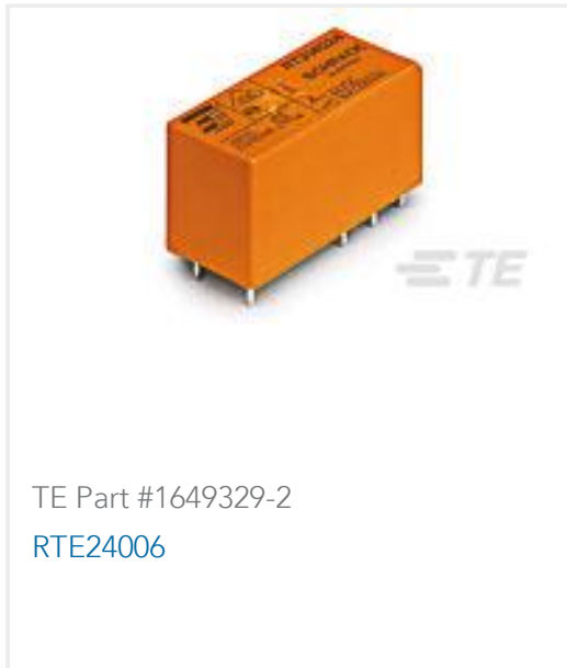
TE Part #1649329-2 RTE24006