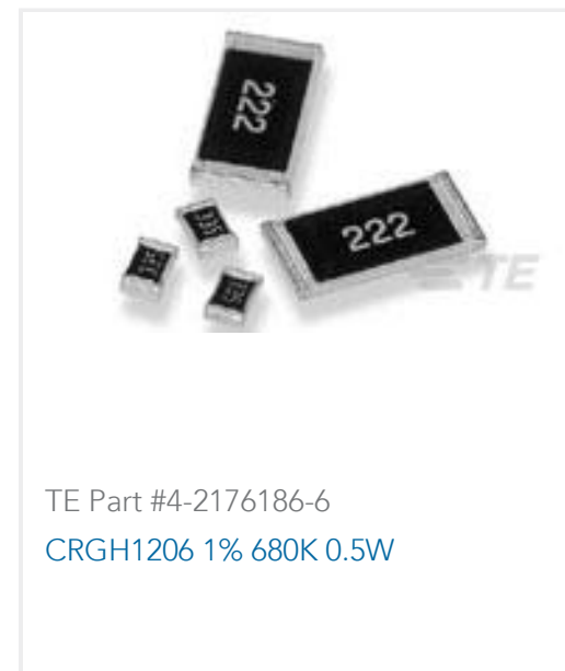
TE Part #4-2176186-6 CRGH1206 1% 680K 0.5W