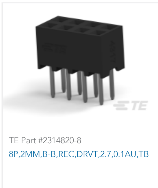
TE Part #2314820-8 8P,2MM,B-B,REC,DRVT,2.7,0.1AU,TB