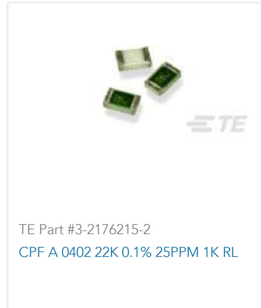
TE Part #3-2176215-2 CPF A 0402 22K 0.1% 25PPM 1K RL