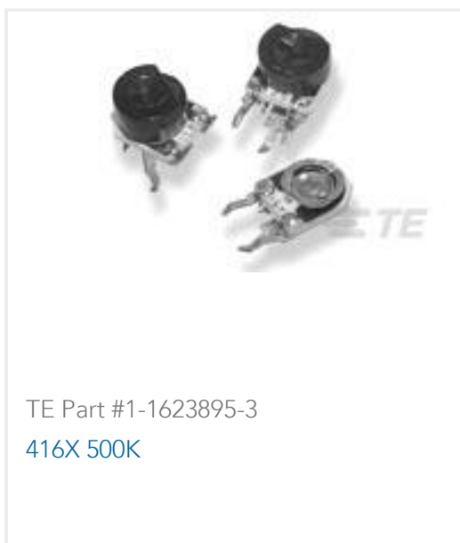
TE Part #1-1623895-3 416X 500K