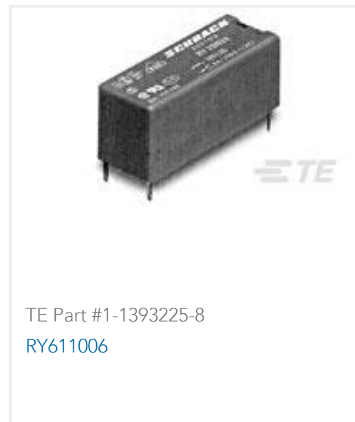
TE Part #1-1393225-8 RY611006