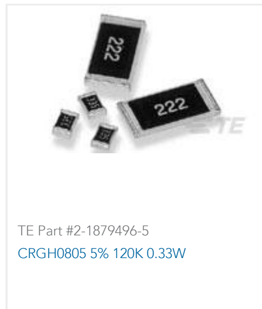
TE Part #2-1879496-5 CRGH0805 5% 120K 0.33W