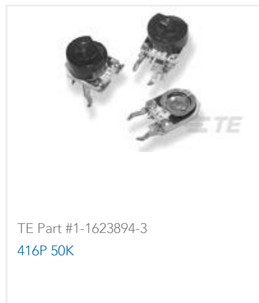
TE Part #1-1623894-3 416P 50K