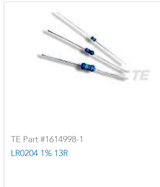
TE Part #1614998-1 LR0204 1% 13R