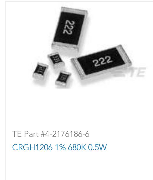
TE Part #4-2176186-6 CRGH1206 1% 680K 0.5W