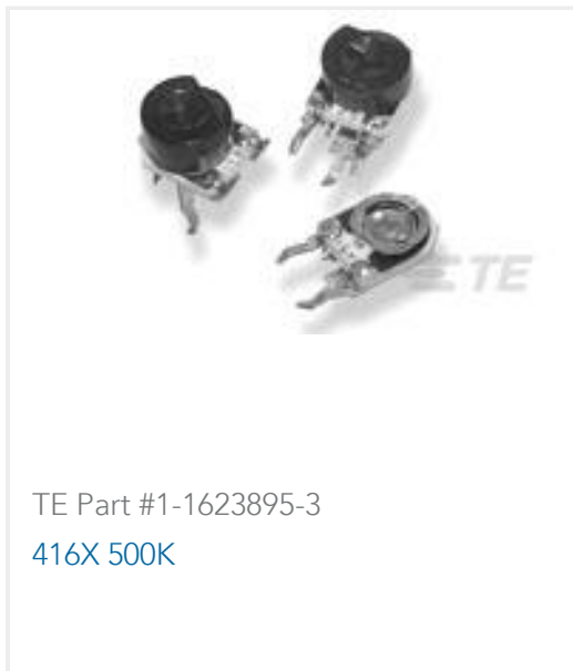
TE Part #1-1623895-3 416X 500K