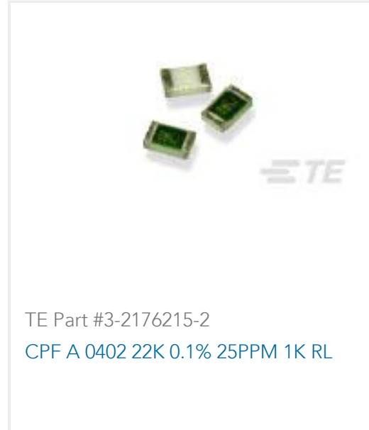
TE Part #3-2176215-2 CPF A 0402 22K 0.1% 25PPM 1K RL