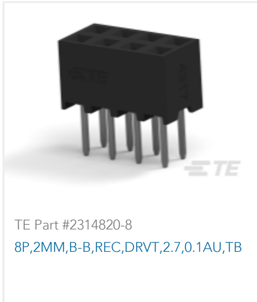
TE Part #2314820-8 8P,2MM,B-B,REC,DRVT,2.7,0.1AU,TB