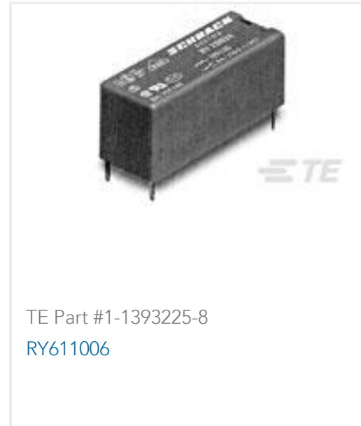
TE Part #1-1393225-8 RY611006