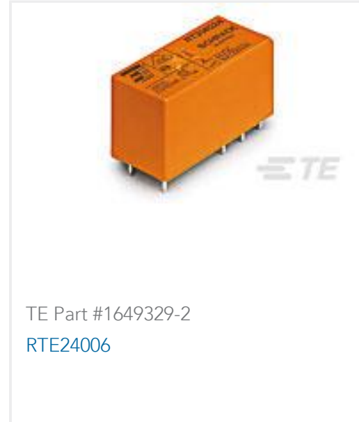
TE Part #1649329-2 RTE24006