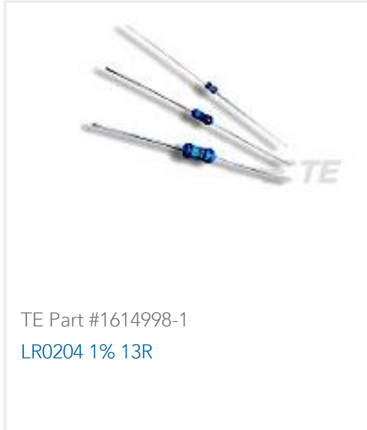
TE Part #1614998-1 LR0204 1% 13R