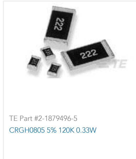
TE Part #2-1879496-5 CRGH0805 5% 120K 0.33W