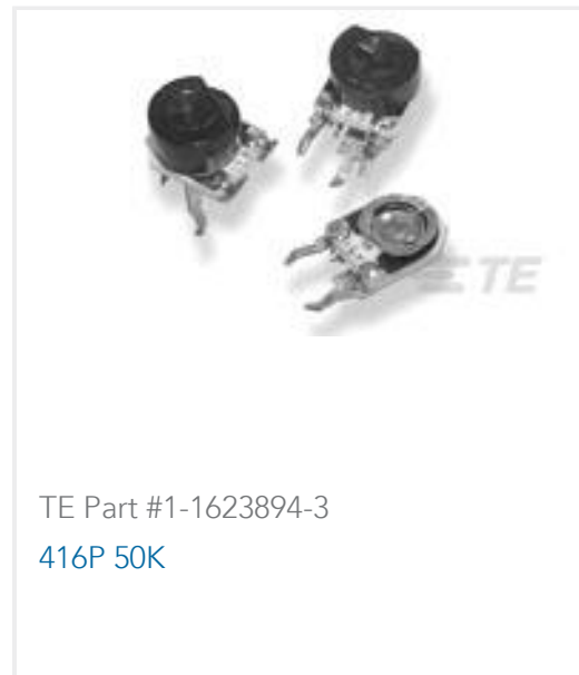
TE Part #1-1623894-3 416P 50K