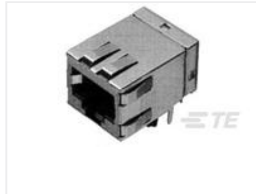
TE Part #6116526-1 MJ ASSY,8POS,R/A,SHLD,CAT5e