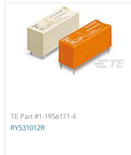
TE Part #1-1956171-4 RY531012R