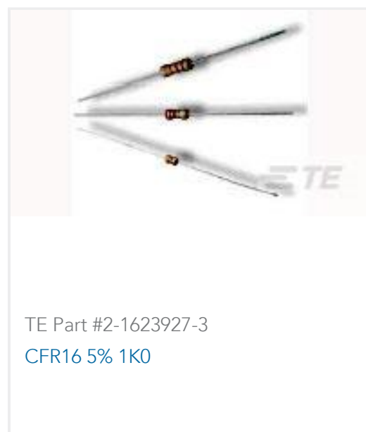
TE Part #2-1623927-3 CFR16 5% 1K0