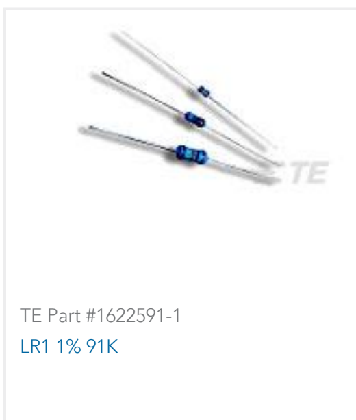
TE Part #1622591-1 LR1 1% 91K