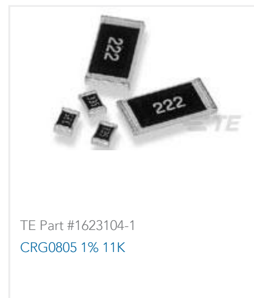
TE Part #1623104-1 CRG0805 1% 11K