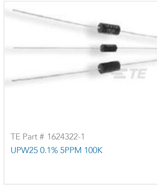
TE Part # 1624322-1 UPW25 0.1% 5PPM 100K