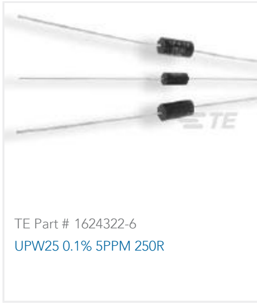
TE Part # 1624322-6 UPW25 0.1% 5PPM 250R