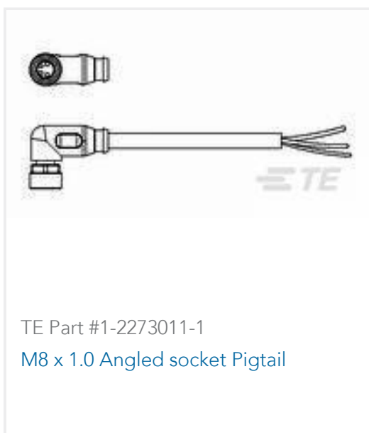
TE Part #1-2273011-1 M8 x 1.0 Angled socket Pigtail