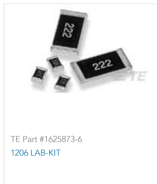
TE Part #1625873-6 1206 LAB-KIT