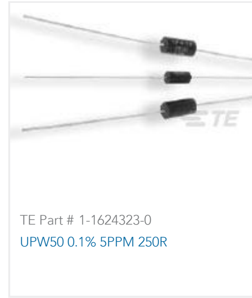
TE Part # 1-1624323-0 UPW50 0.1% 5PPM 250R