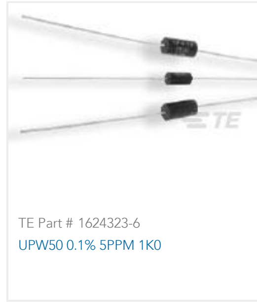
TE Part # 1624323-6 UPW50 0.1% 5PPM 1K0