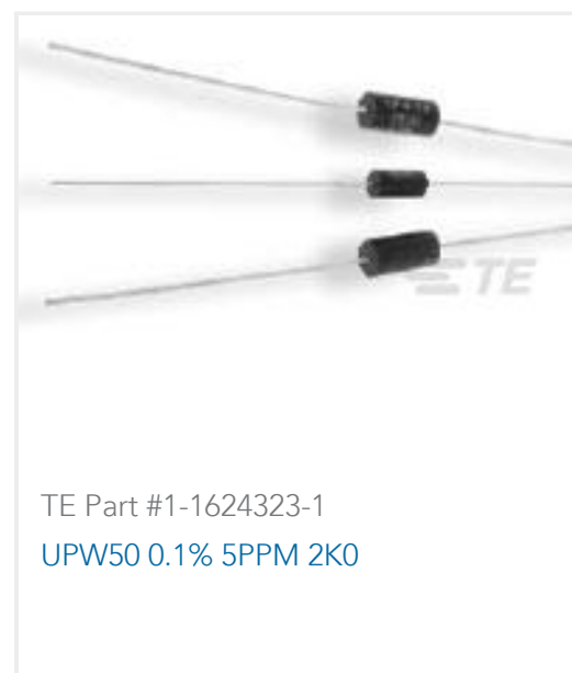
TE Part #1-1624323-1 UPW50 0.1% 5PPM 2K0