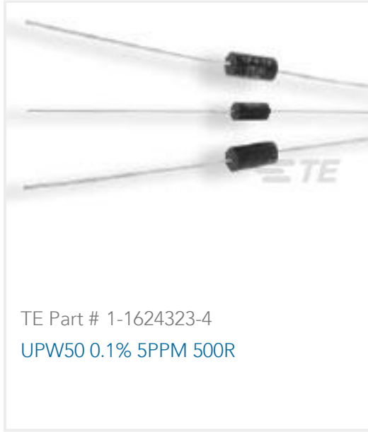
TE Part # 1-1624323-4 UPW50 0.1% 5PPM 500R