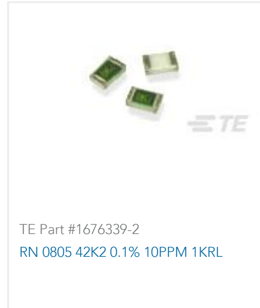
TE Part #1676339-2 RN 0805 42K2 0.1% 10PPM 1KRL