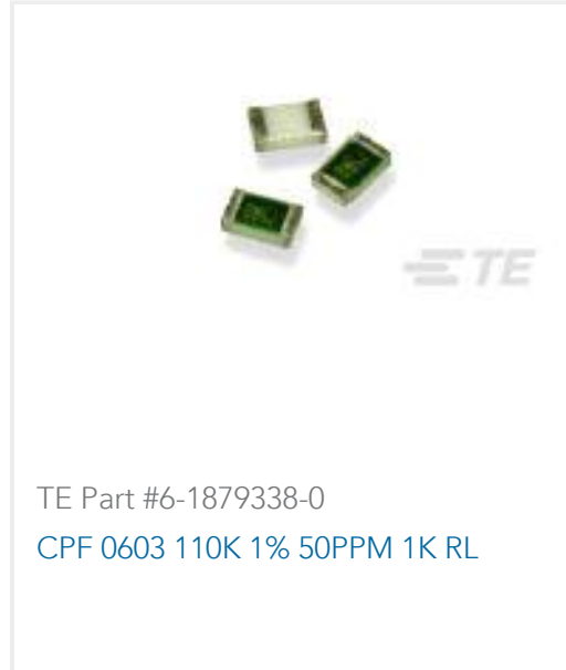
TE Part #6-1879338-0 CPF 0603 110K 1% 50PPM 1K RL