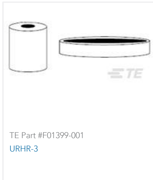
TE Part #F01399-001 URHR-3