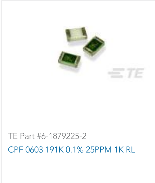
TE Part #6-1879225-2 CPF 0603 191K 0.1% 25PPM 1K RL