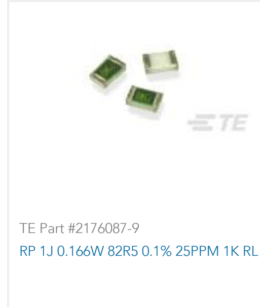
TE Part #2176087-9 RP 1J 0.166W 82R5 0.1% 25PPM 1K RL