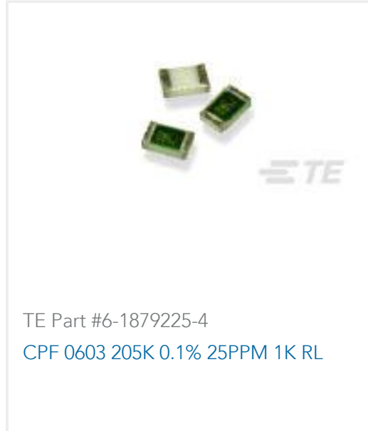
TE Part #6-1879225-4 CPF 0603 205K 0.1% 25PPM 1K RL