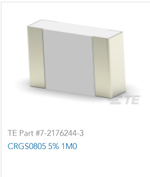
TE Part #7-2176244-3 CRGS0805 5% 1M0