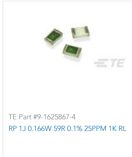
TE Part #9-1625867-4 RP 1J 0.166W 59R 0.1% 25PPM 1K RL