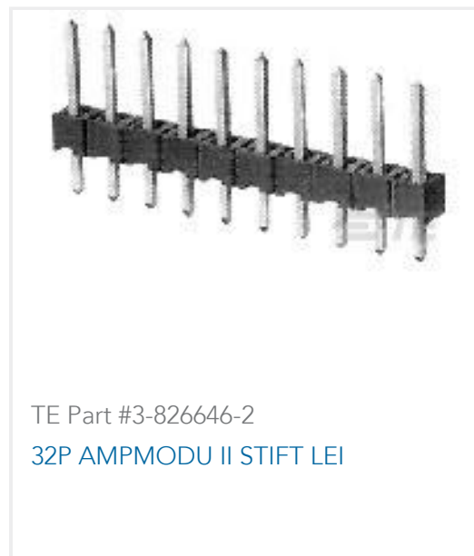
TE Part #3-826646-2 32P AMPMODU II STIFT LEI