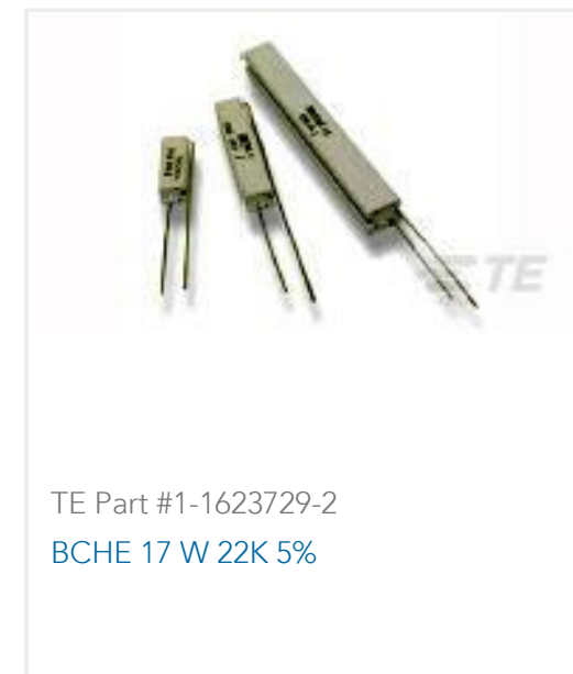
TE Part #1-1623729-2 BCHE 17 W 22K 5%