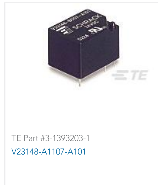
TE Part #3-1393203-1 V23148-A1107-A101