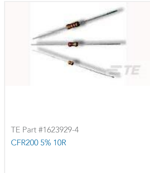
TE Part #1623929-4 CFR200 5% 10R