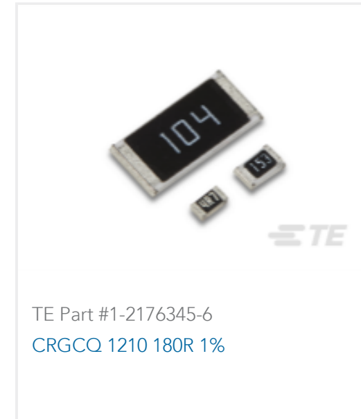
TE Part #1-2176345-6 CRGCO 1210 180R 1%