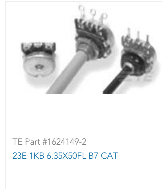
TE Part #1624149-2 23E 1KB 6.35X50FL B7 CAT