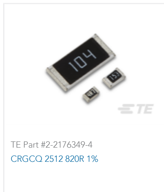
TE Part #2-2176349-4 CRGCO 2512 820R 1%