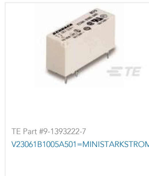
TE Part #9-1393222-7 V23061B1005A501=MINISTARKSTROM