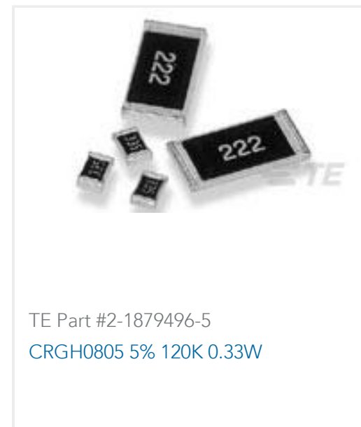
TE Part #2-1879496-5 CRGH0805 5% 120K 0.33W