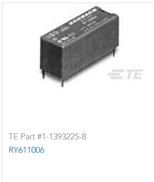
TE Part #1-1393225-8 RY611006