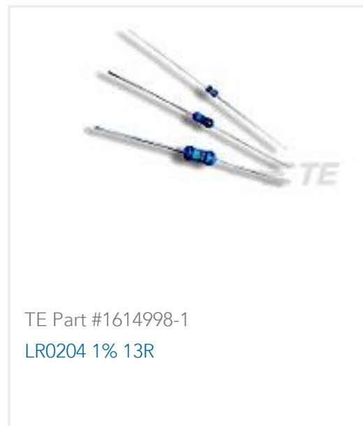
TE Part #1614998-1 LR0204 1% 13R