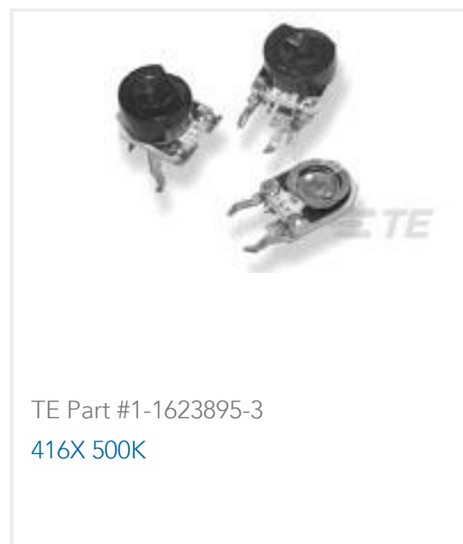
TE Part #1-1623895-3 416X 500K