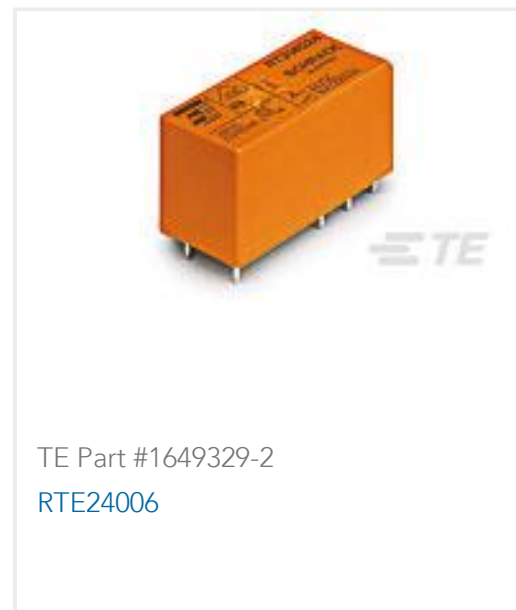
TE Part #1649329-2 RTE24006