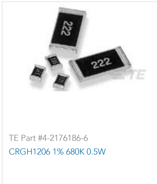
TE Part #4-2176186-6 CRGH1206 1% 680K 0.5W