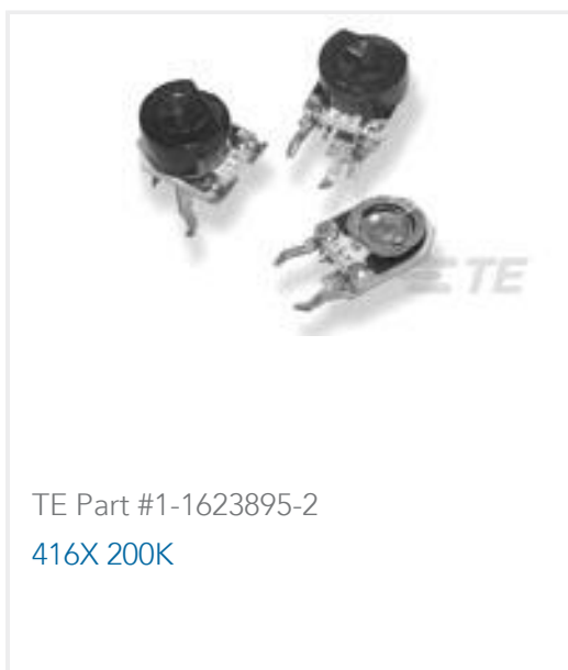
TE Part #1-1623895-2 416X 200K