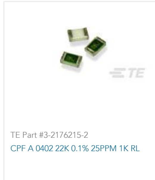
TE Part #3-2176215-2 CPF A 0402 22K 0.1% 25PPM 1K RL