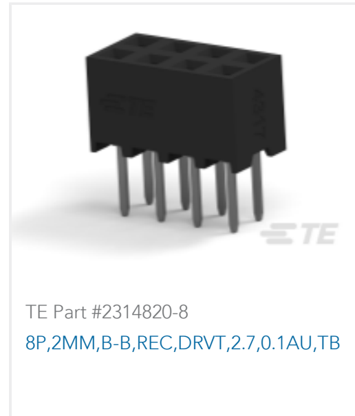
TE Part #2314820-8 8P,2MM,B-B,REC,DRVT,2.7,0.1AU,TB