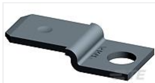
TE Part #42506-2 250 FASTON TAB TPBR