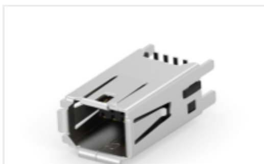
TE Part #2271656-1 VERTICAL SMT TYPE I MINI IO REC S CONN