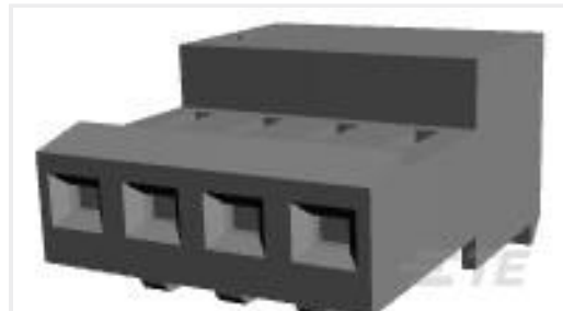
TE Part #3-644574-4 04P MTA100 CONN ASSY BLK LF