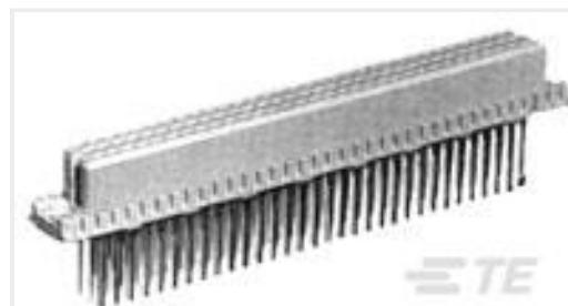
TE Part #1-148057-5 096 EURO TYP C RECP 13MM ASSY