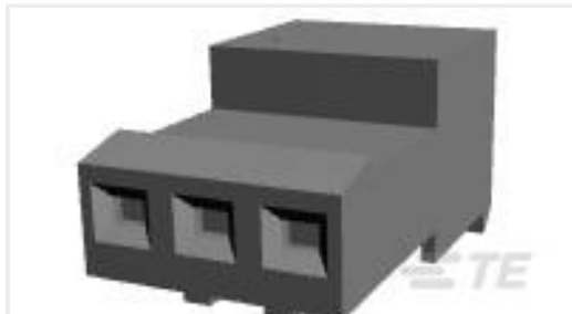
TE Part #3-643498-3 03P MTA100 CONN ASSY LF