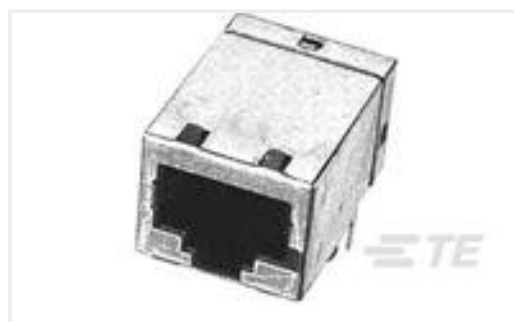
TE Part #5569564-1 MJ ASSY,R/A,8 POS,LED GRN&YELW