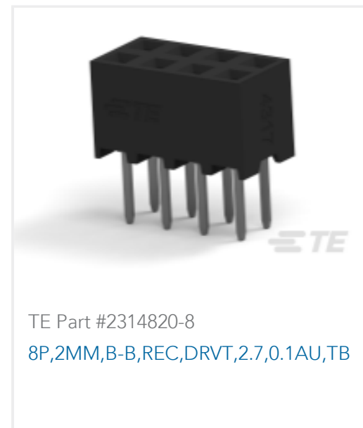
TE Part #2314820-8 8P,2MM,B-B,REC,DRVT,2.7,0.1AU,TB