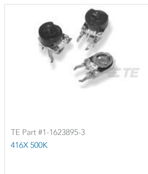
TE Part #1-1623895-3 416X 500K