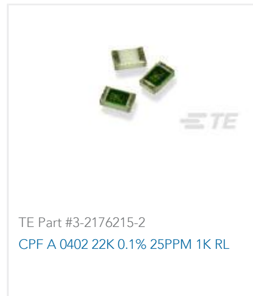
TE Part #3-2176215-2 CPF A 0402 22K 0.1% 25PPM 1K RL