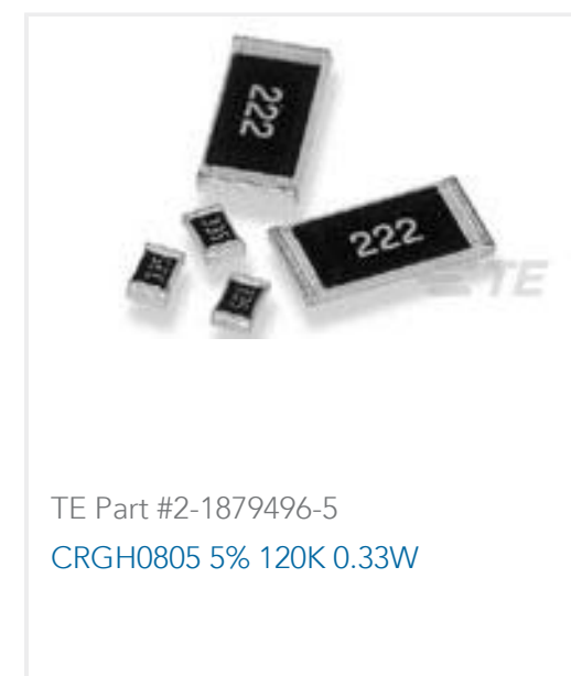
TE Part #2-1879496-5 CRGH0805 5% 120K 0.33W