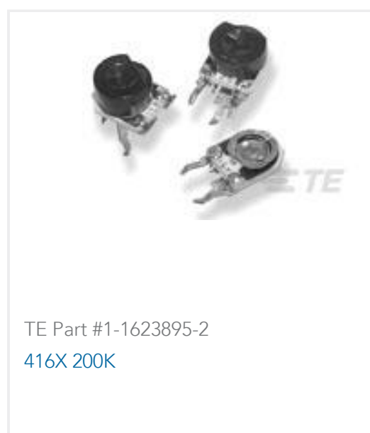
TE Part #1-1623895-2 416X 200K