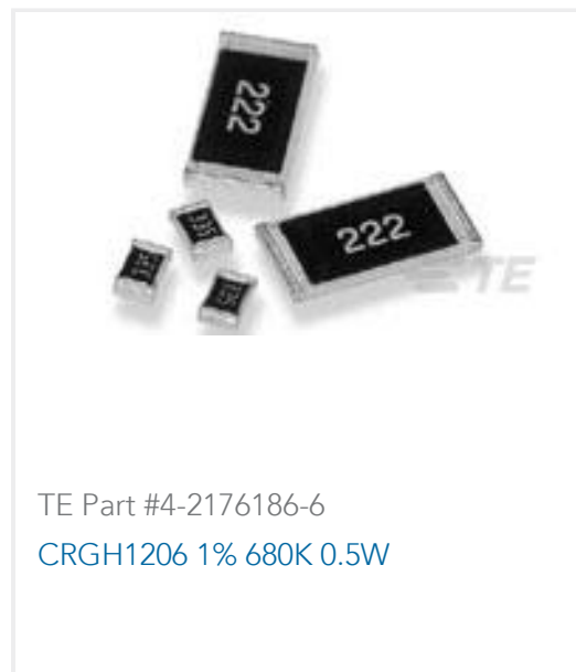
TE Part #4-2176186-6 CRGH1206 1% 680K 0.5W