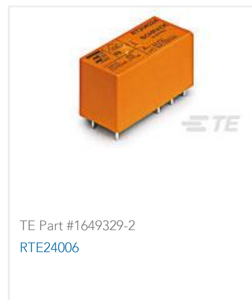
TE Part #1649329-2 RTE24006