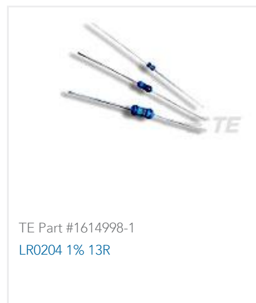
TE Part #1614998-1 LR0204 1% 13R