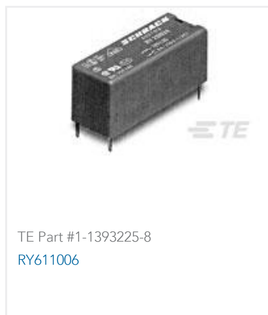
TE Part #1-1393225-8 RY611006