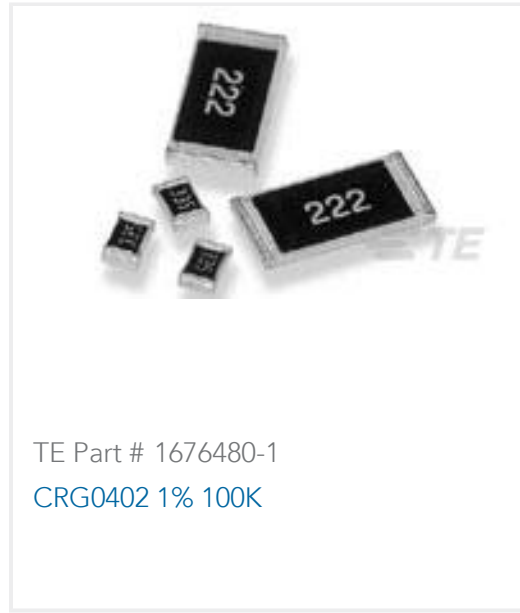
TE Part # 1676480-1 CRG0402 1% 100K