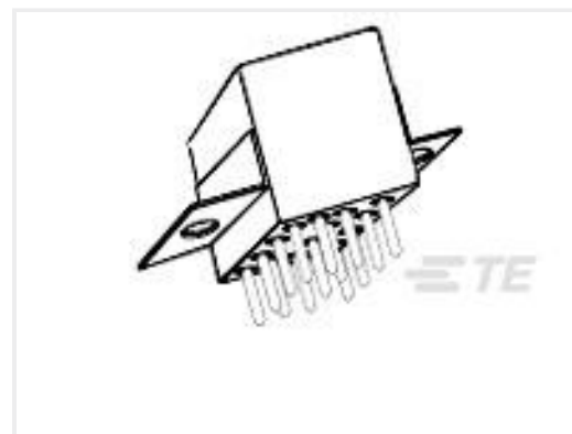
TE Part #7-1617772-6 FCA-410-BZ2= RELAY