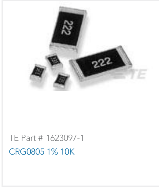
TE Part # 1623097-1 CRG0805 1% 10K