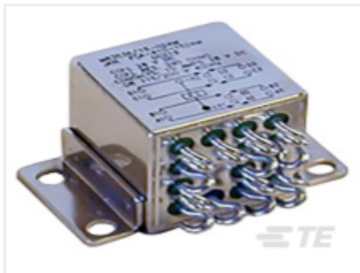
TE Part #1-1617789-4 FCA-410-BX2= MIDRANGE RELAY