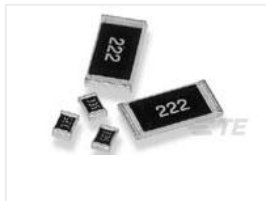
TE Part #1623504-1 CRG1206 1% 3K6