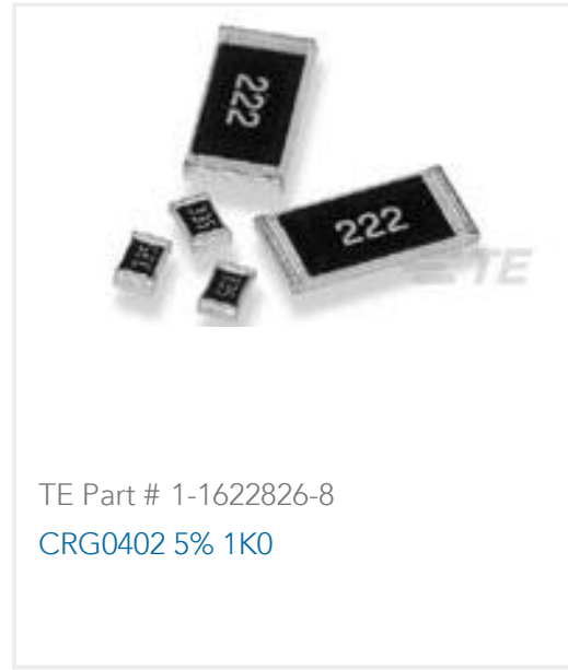
TE Part # 1-1622826-8 CRG0402 5% 1K0