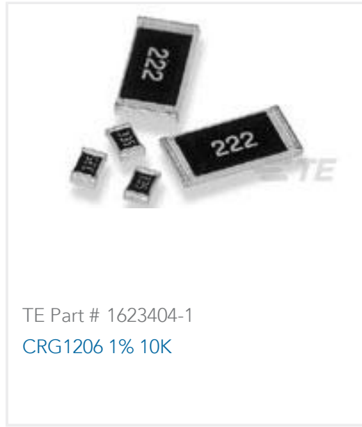
TE Part # 1623404-1 CRG1206 1% 10K