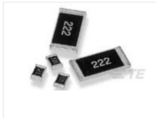
TE Part #1623528-1 CRG1206 1% 4R7