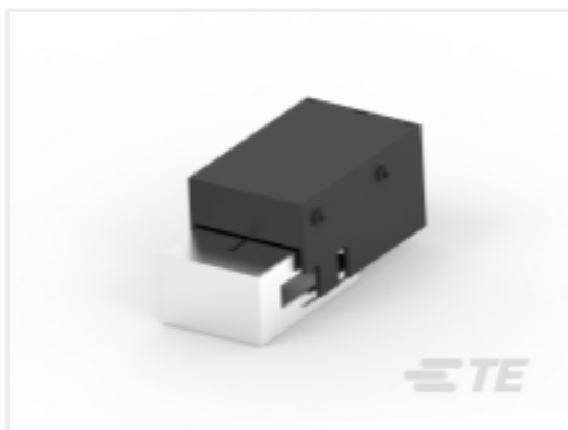
TE Part #2215020-2 KIT, SEATING TOOL, ZQSFP+, 2X2