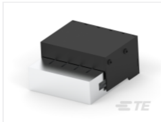
TE Part #2215000-3 KIT, SEATING TOOL, zSFP+, 2X4