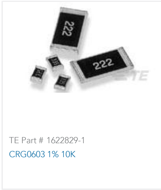
TE Part # 1622829-1 CRG0603 1% 10K