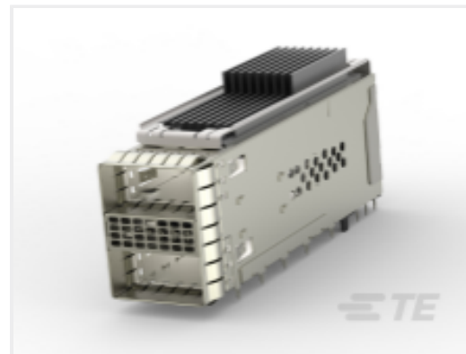
TE Part #2299940-3 ZQSFP+ STACKED REC ASSEMBLY 2X1,HS