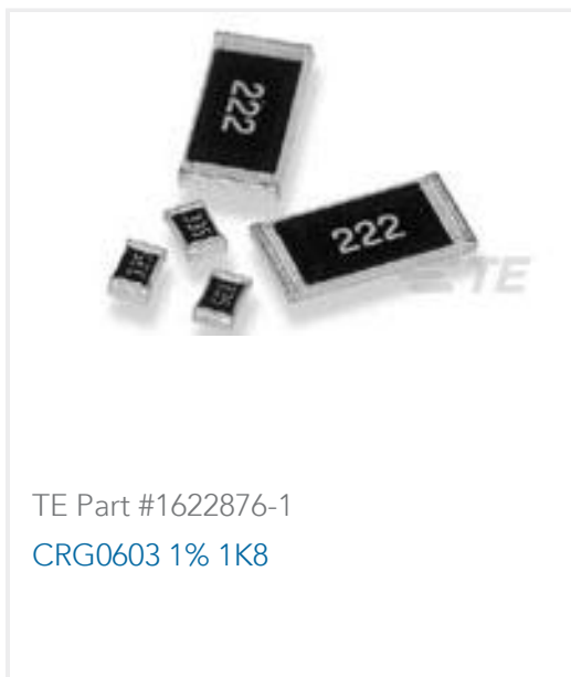
TE Part #1622876-1 CRG0603 1% 1K8